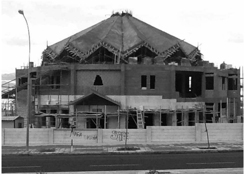
The construction work for the Church of Stella Maris in Aqaba as it was at the end of March.

The Equestrian Order of the Holy Sepulchre of Jerusalem is involved once again in 2012 in the realization of two of the more demanding projects of the Latin Patriarchate, projects whose work was suspended last year: these are the construction of Stella Maris parish Church and multi-purpose room annex and a secondary school in Rameh, in Galilee.