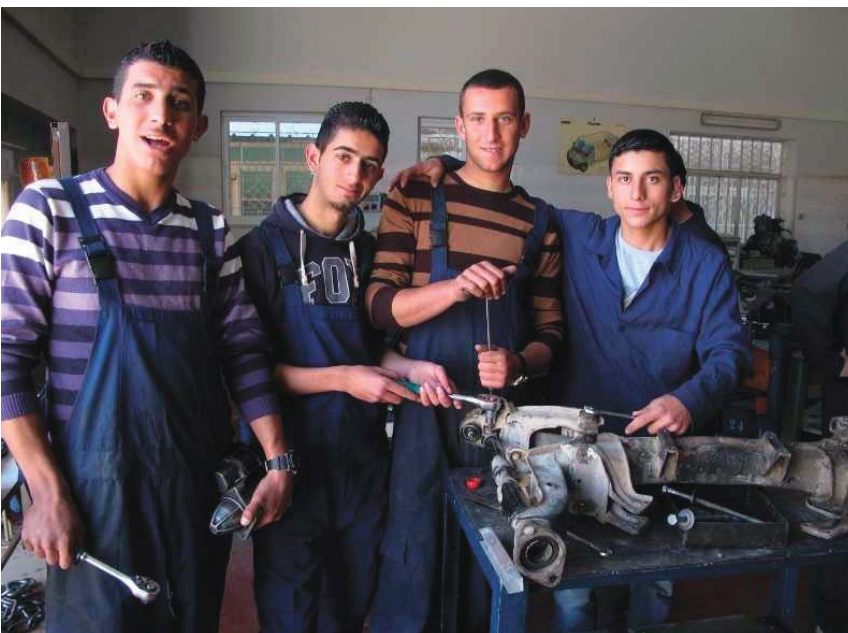
Some of the young people in the Professional Training Centre run by the Salesians in Bethlehem during one of their workshops

We also received thanks from the Salesians of Bethlehem who, for many years, have been carrying out various activities related to vocational training and integration into the world of work for young people, so that they may find a job without being forced to emigrate. In addition to the activities of the youth centre and the oratory, the Salesians also run a technical college attended by about 160 students, a vocational training centre with the same number of students, and an art school.