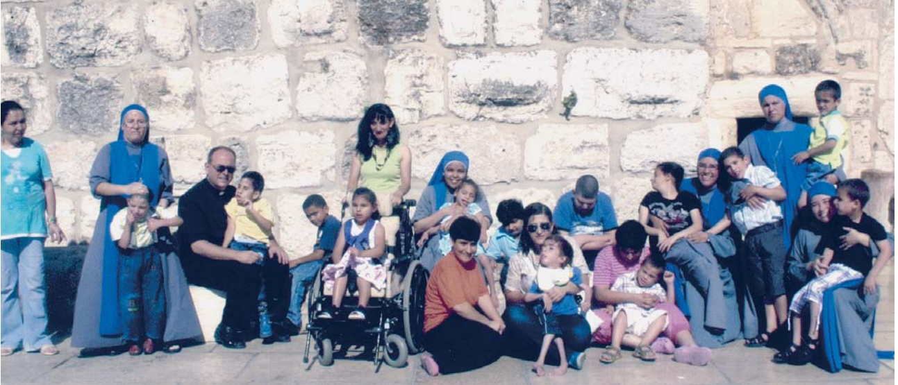
The Sisters of the Incarnate Word with the children they care for in the house of "Hogar Niño Dios"

I t is with joy that we have received thanks for the projects that the Order supports in Bethlehem, and we are pleased to share these with you. We also show some pictures of young people who benefit from our help.