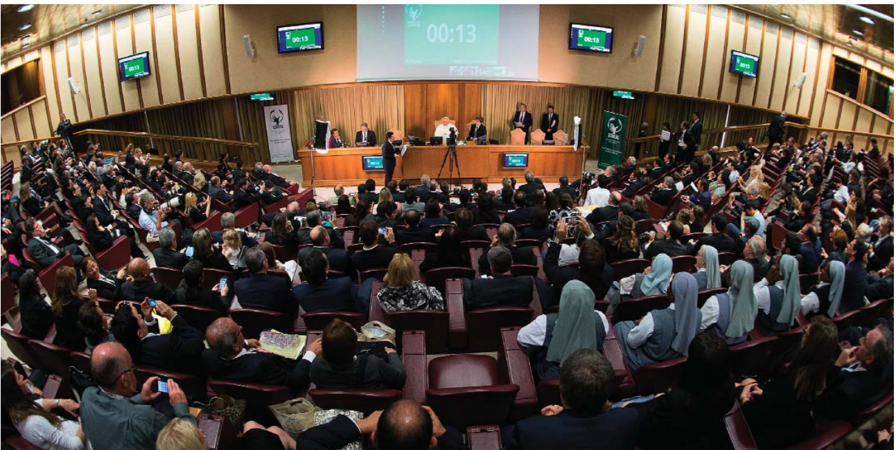
The Pope is linked via a live video-conference from the Synod Hall to school children of various schools throughout the world

ence from the Synod Hall, near the house of Saint Martha, which notably included children from Israel. "Build bridges of peace, play as a team and make the future better", Francis told them. In connection with the congress of the network Scholas, an interfaith match for peace took place at the same time, in the presence of the Argentinean football player Diego Maradona, who, touched by the testimony of the evangelical life of Pope Francis, expressed his wish to return to the practice of the Catholic faith. It is up to us too, at all levels of the Order of the Holy Sepulchre, to build bridges rather than raising walls. "Hope sees what has not yet been and what will be. It loves what has not yet been and what will be" (Charles Péguy).