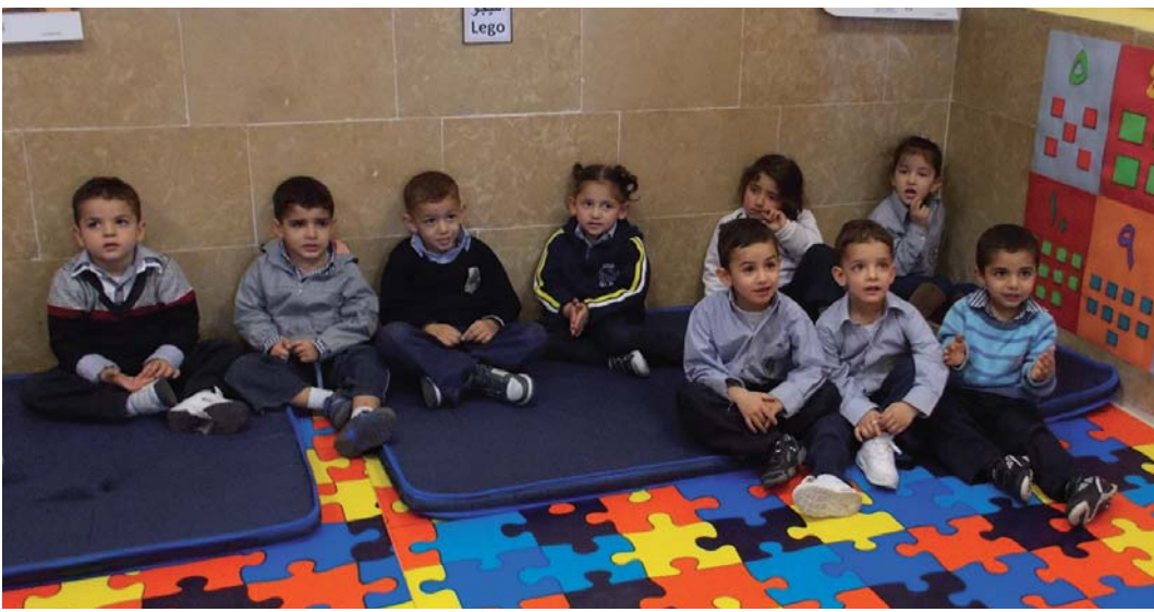
A kindergarten of the Patriarchate supported by the Order.

Pope, in which he took part with other Catholic Patriarchs concerned, noting, for example, the measures taken by the King of Jordan to accommodate persecuted Christians from Syria and Iraq. He also reiterated, before the Grand Magisterium, his call for the purchase of houses and buildings in Bethlehem where the Muslim presence intensifies, and similarly in Jerusalem as regards the Jewish presence, to allow long-term housing of Christian families in these two cities of prime importance to the Church.