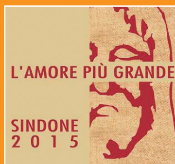
The Official logo of the exhibition of the Holy Shroud in Turin in 2015.

Contact on the official site: www.sindone.org