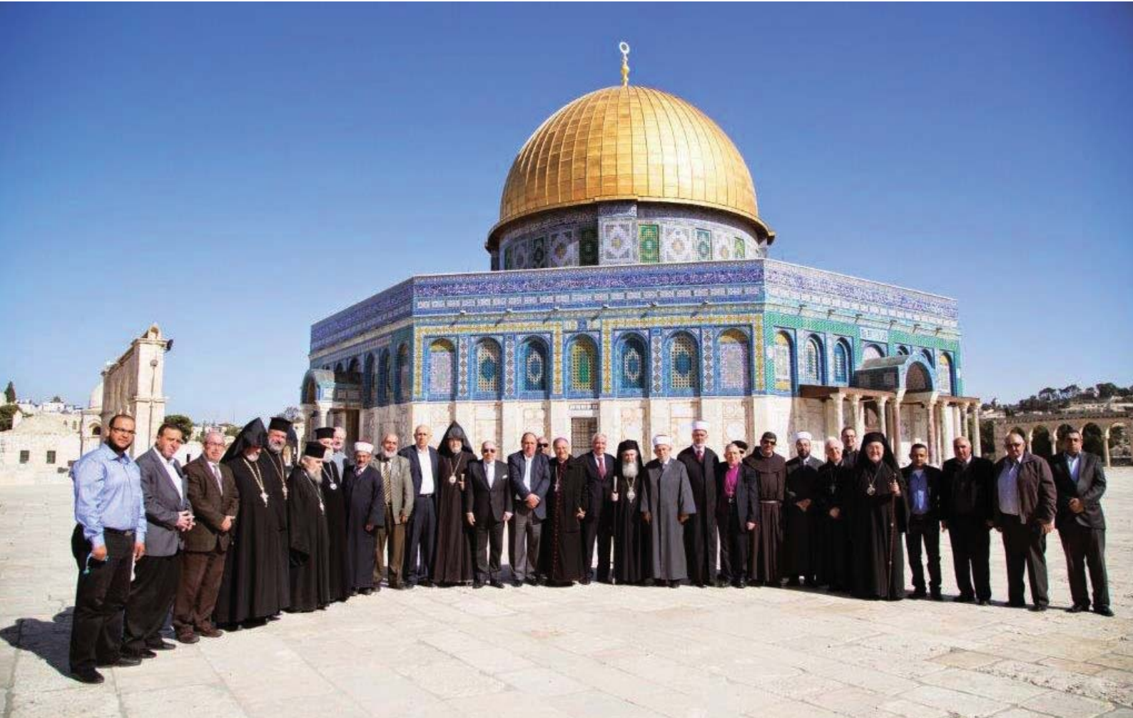
A delegation of heads of the Christian Churches in Jerusalem and Muslim religious leaders of the Holy City, at the Temple Mount on 10 November.

"We condemn the threats to change the status of the Holy Places, whatever their origins. Holy Sites require constant vigil and protection so that reasonable access may be maintained as required by the Status Quo for the three monotheistic religions".