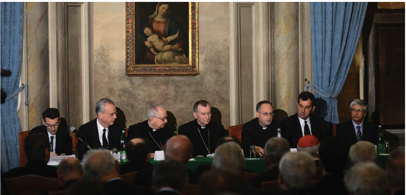
The speakers on the theme Digital Communication and Diplomacy, 5 December, at the headquarters of the Grand Magisterium of the Order of the Holy Sepulchre.