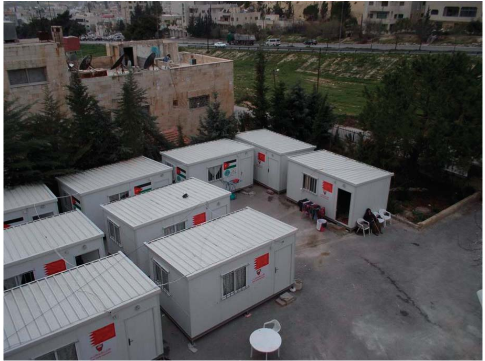
In a Jordanian parish of the Latin Patriarchate: caravans installed to lodge refugees from other countries of the Middle East.