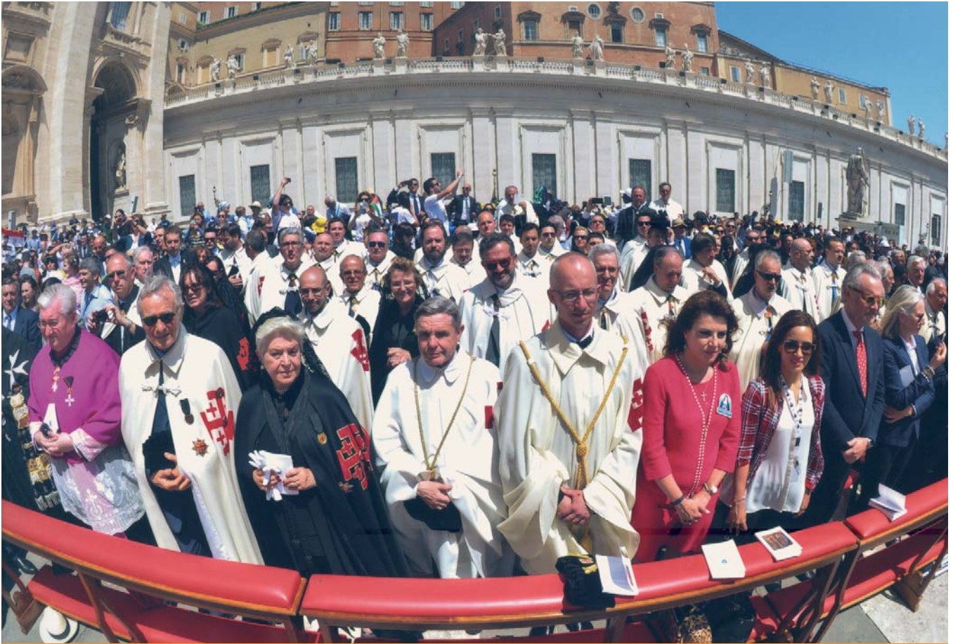
Knights and Dames of the Order of the Holy Sepulchre in Saint Peter's Square during the canonization of the two Palestinian saints.

God in the apostolate, and to be a witness to meekness and unity. She shows us the importance of becoming responsible for one another, of living lives of service one to another."