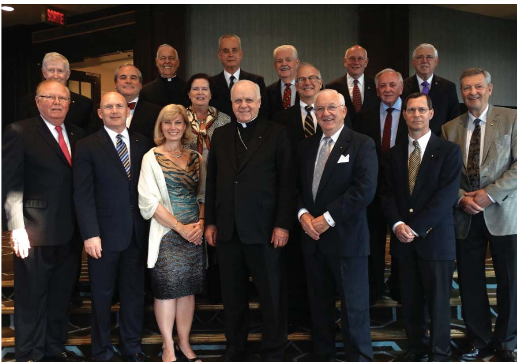
The Grand Master of the Order of the Holy Sepulchre with the Lieutenants from North America in Quebec, in June 2015 (a report on this meeting will be included in our next Newsletter).

For which we offer thanks to Our Lord, and to our every single and generous member.