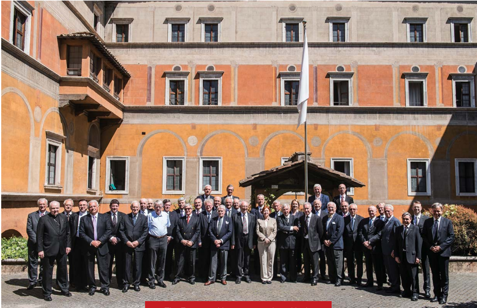
The European Lieutenants gathered in the Palazzo Della Rovere, in May 2015.

on all continents, to offer his contribution in mobilizing them in favour of Eastern Christians, many of whom have found refuge in the parishes of the Latin Patriarchate of Jerusalem, particularly in the Hashemite Kingdom of Jordan.