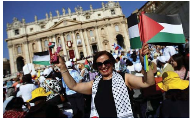
A delegation of Palestinian Christians in Rome was overjoyed during the celebration on May 17, 2015, paying tribute to the testimony of their canonized compatriots: Saint Mariam and Saint Marie-Alphonsine.

During his homily, Pope Francis recalled Mariam Baouardy's "docility to the Holy