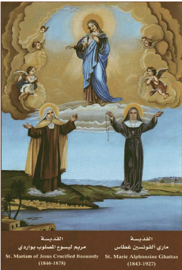
القديسة مريم يسوع المصلوب باوردي

St. Mariam of Jesus Crucified Baouardy (1846-1878)