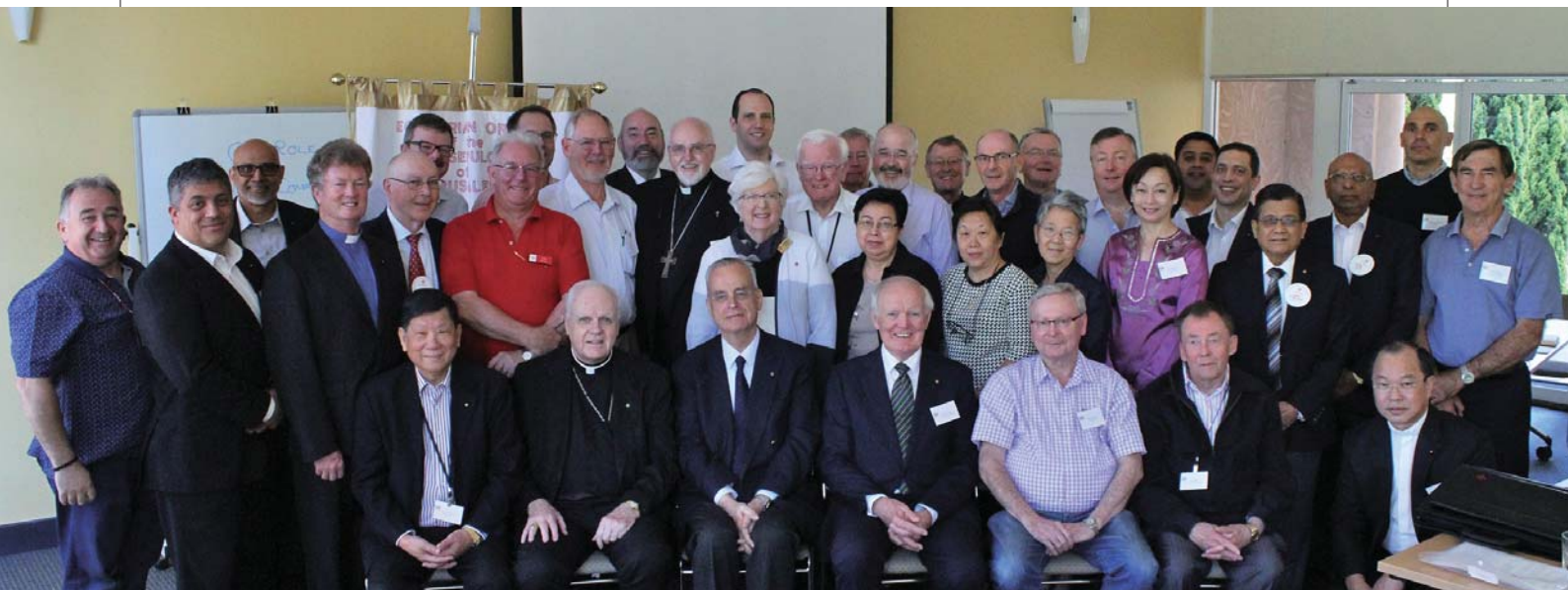
A group photo during the first regional meeting of Lieutenancies of Asia and Oceania, organized by the Order of the Holy Sepulchre in Adelaide, Australia, in the month of October 2015.