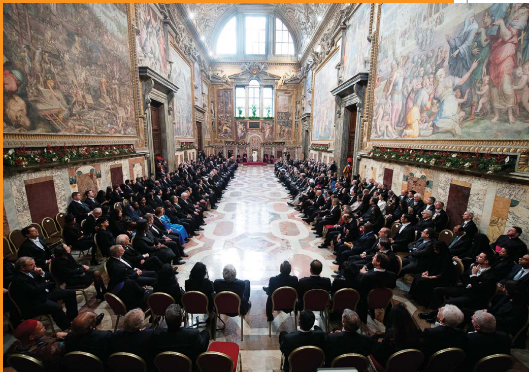
Pope Francis' meeting with the Diplomatic Corps last January 11.

With courage and perseverance, the Holy Father pushes towards peace through this exemplary Agreement in order to end the Israeli-Palestinian conflict. In this way he continues to fight against the roots of the evil, which, in part, feed international terrorism, determined to act on the causes and not on the effects. Forty years ago Blessed Pope Paul VI was the first pope to affirm that the Palestinians do not form a single group of refugees but a people.