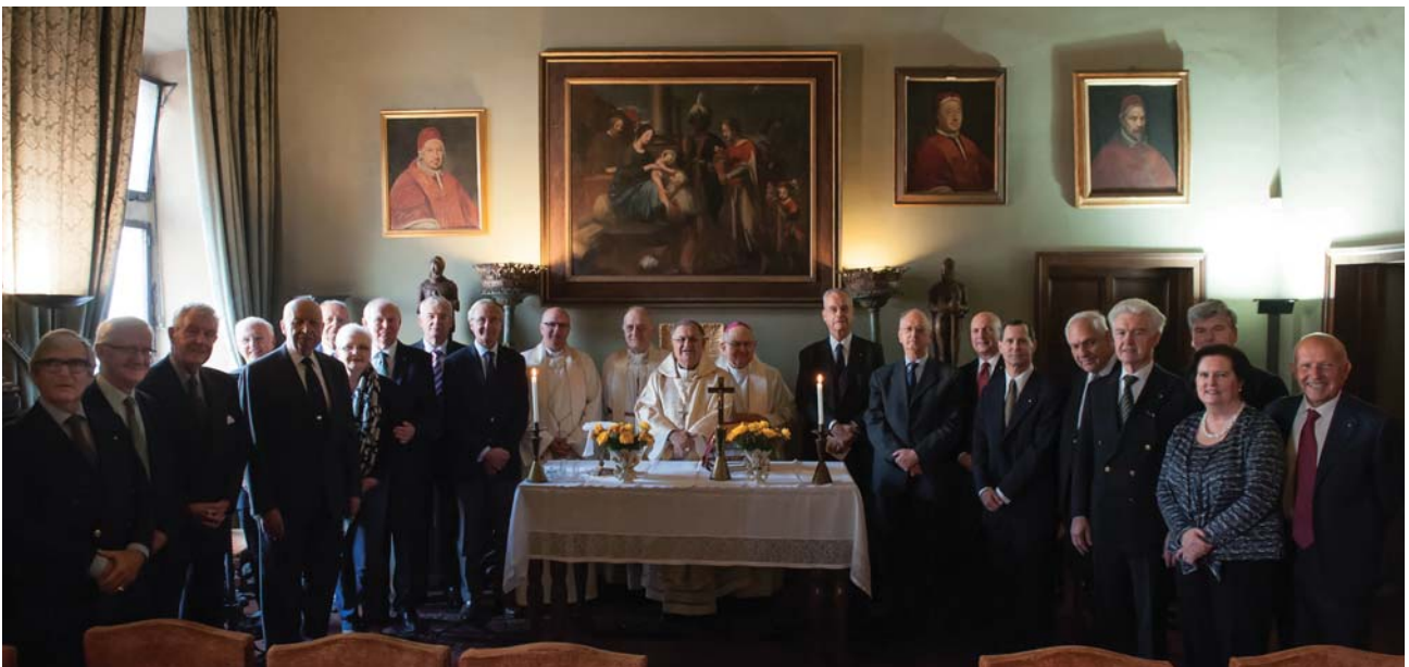
Members of the Grand Magisterium gathered for the morning Mass at the opening of their work meeting in Rome last November.