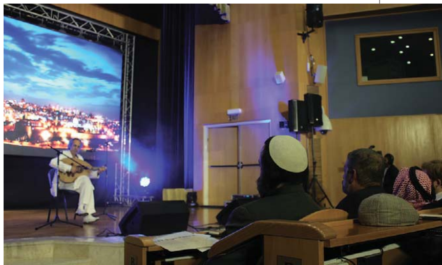
A prophetic meeting in which faithful from three monotheistic religions expressed the desire to live in friendship in the biblical lands.

dear to Jews, Christians and Muslims, and where various religious communities live side by side. On November 12, the Institute of Notre Dame then hosted the Jerusalem Expo 2015, which gave the opportunity to attend art exhibitions portraying local talent and to hear the moving testimonies of people and groups who work for understanding, dialogue and peace.