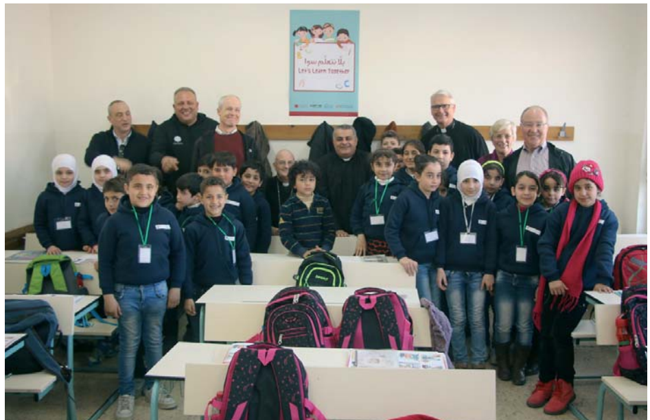
The Catholic Church in the Holy Land is at the forefront in welcoming refugees from the Middle East, above all in the organization of schooling for children and young people. The Order greatly contributed to these actions in 2015 through a generous donation to Caritas Jordan.