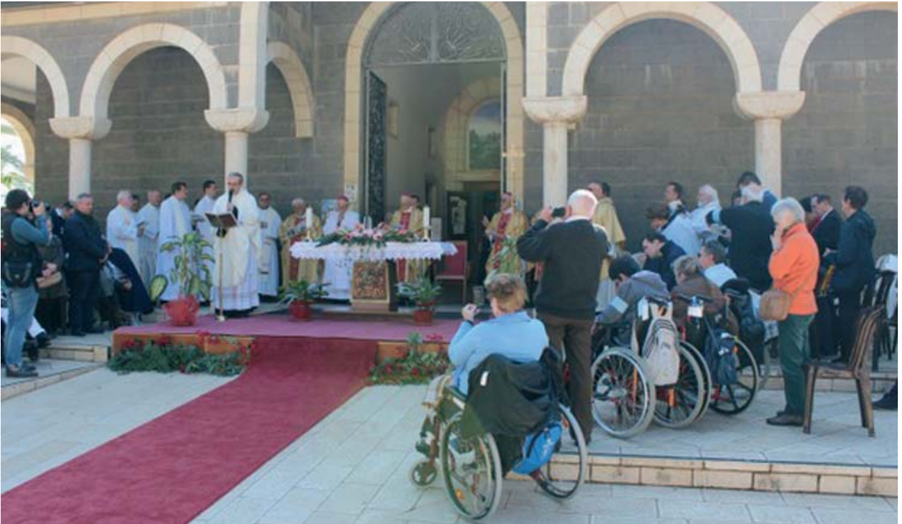
A delegation from the Pontifical Council for Health Care Workers took part this year in celebrations for the XXIV World Day for the Sick in the Holy Land. The event, which took place in Nazareth on February 11, also gave rise to a pilgrimage from April February 6 to 13, during which the delegation visited the Mount of the Beatitudes and participated in the celebration of Mass together with various disabled (see photo).

encounter and peace, where the experience of illness and suffering, along with professional and fraternal assistance, helps to overcome every limitation and division", Pope Francis said in his important message published on the occasion of this World Day of the Sick, eager that it might help to carry out the wish expressed in the Bull of Indiction of the Extraordinary Jubilee of Mercy ( Misericordiae Vultus , April 11, 2015): "I trust that this Jubilee year celebrating the mercy of God will foster an encounter with these religions [Judaism and Islam] and with other noble religious traditions; may it open us to even more fervent dialogue so that we might know and understand one another better; may it eliminate every form of closed-mindedness and disrespect, and drive out every form of violence and discrimination" ( Misericordiae Vultus , 23).