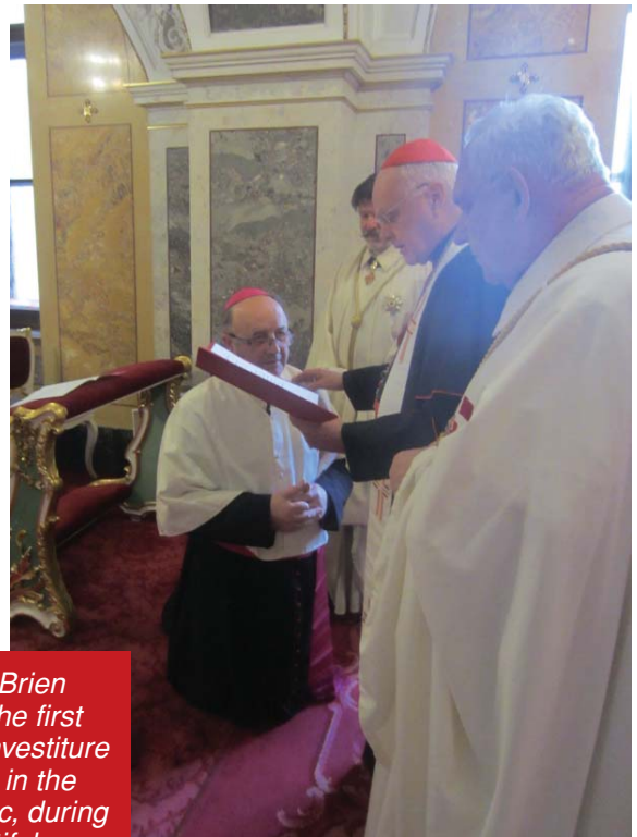
Cardinal O'Brien presided at the first ceremony of Investiture in Olomouc, in the Czech Republic, during the beautiful ceremonies held April 16 and 17.

Cardinal Edwin O'Brien had the opportunity of meeting the members of the Grand Magisterium for the usual Spring meeting (April 11-13), at the Order's headquarters in Palazzo della Rovere, and in the coming three months he will meet with a significant number of Lieutenants for the regional meetings of the Lieutenants of North America (June 2-4 in Baltimore, the United States) and of Europe (June 27-28 in Rome). In addition, the Grand Master was present for the first Investiture of the Magistral Delegation for the Czech Republic in Olomouc: the Grand Prior Msgr. Jan Graubner, the Archbishop of Olomouc, received the Investiture on April 16 (see photo on the right), and the following day was the turn of the new Knights and Dames. On June 10 and 11, His Eminence will preside over the Investiture ceremonies in Pelplin, Poland.