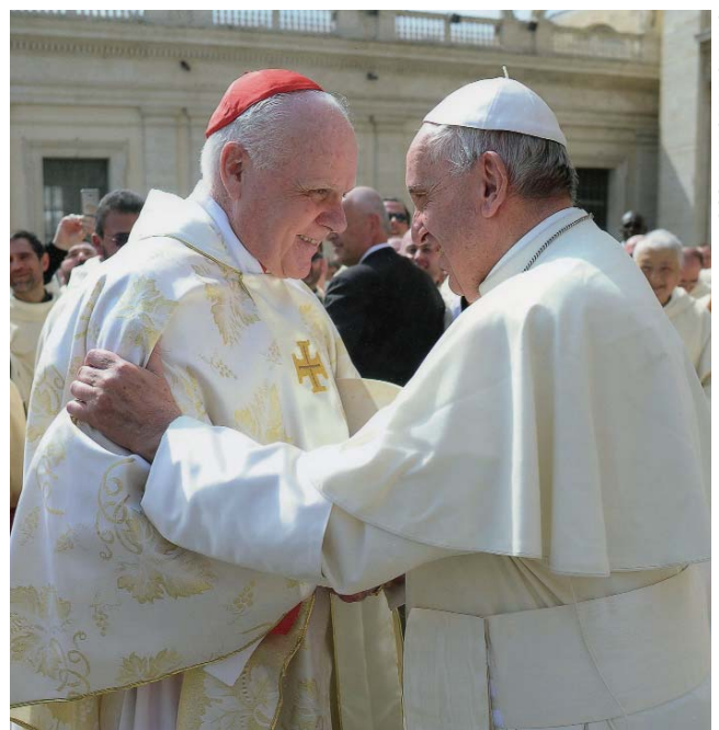
Cardinal O'Brien together with the Holy Father on Divine Mercy Sunday, April 3, St. Peter's Square.

The recent words of the first female Catholic mayor of embattled Bethlehem might serve as