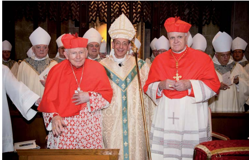
The Cardinals Keeler and O'Brien around the current Archbishop of Baltimore, Msgr. William Lori, both of whom were his predecessors.

We entrust Cardinal Keeler's soul to divine mercy and, in the communion of the saints, ask him to intercede for the Order and the Holy Land. ■