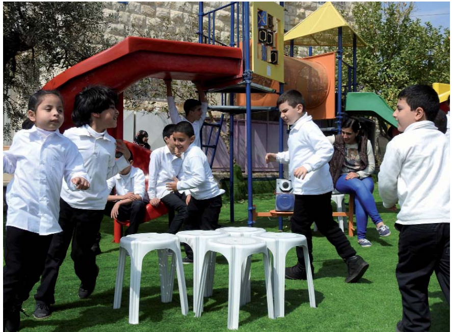
The Holy Child Program welcomes children from Bethlehem with psychological or behavioral problems.

The teachings of the Roman Catholic Church provide the framework for the services the Holy Child Program offers. Franciscan spirituality calls all who work with the Program to care for some of the most vulnerable and often alienated populations. The mission is much like St. Francis "kissing the leper". It is the everyday experiences of the children learning, working, playing and celebrating together in a school atmosphere that transform alienation and vulnerability into strength and joy. The students begin each day together in this Catholic milieu, with a time of prayer, co-facilitated by a Catholic and a Muslim teacher, where they learn the Catholic faith and the precepts of Islam that agree and support the message of love and of peace. Schools registered under the Palestinian Authority are required to teach