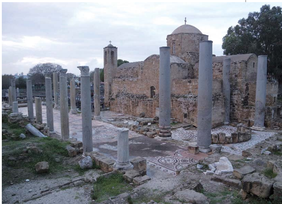
Cyprus, where Christianity has been rooted since its origins, is part of the territories of the Latin Patriarchate of Jerusalem.