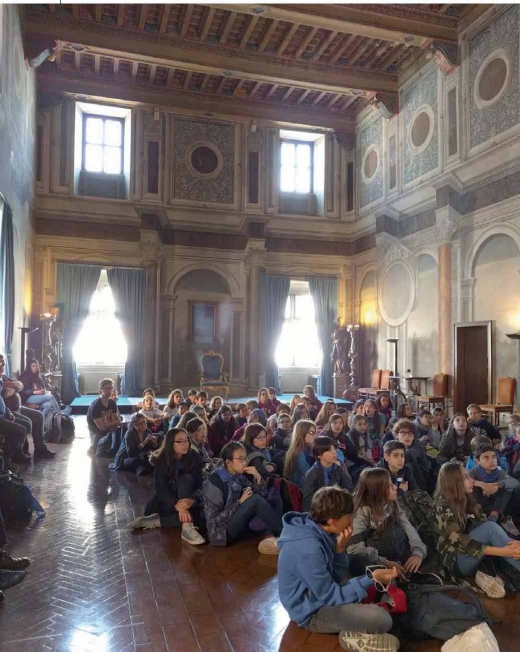
Groups of children visiting Palazzo della Rovere, discover the Order and its mission.

Other groups that came to the Grand Magisterium include members of the Thomas More Leadership Institute in Paris, among which there are members and supporters of the