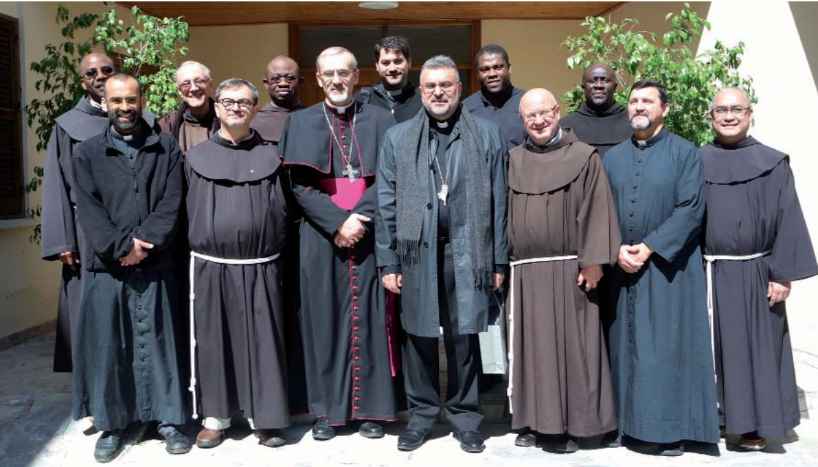
Archbishop Pizzaballa, Administrator of the Latin Patriarchate of Jerusalem, along with some representatives of the local Catholic clergy.

of the Kingdom of Cyprus – reduced the number of Orthodox bishops, forcing them to take refuge in the mountains together with their faithful.