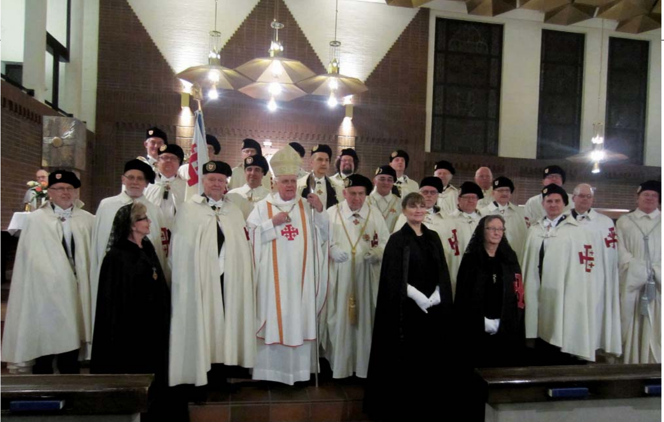
The Investiture of new Order Members in Sweden and Denmark was celebrated by the Grand Master in Stockholm on February 11, 2017.

presence of the Scandinavian Bishops' Conference. When the Lieutenancy for Sweden was established in 2003, the idea was to bring together all the Nordic