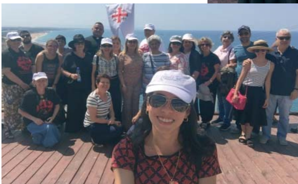
The pilgrimage of the Brazilian Lieutenancy of Rio de Janeiro brought its members to the Holy Land and then to Rome where they had the joy of being able to greet the Grand Master personally.