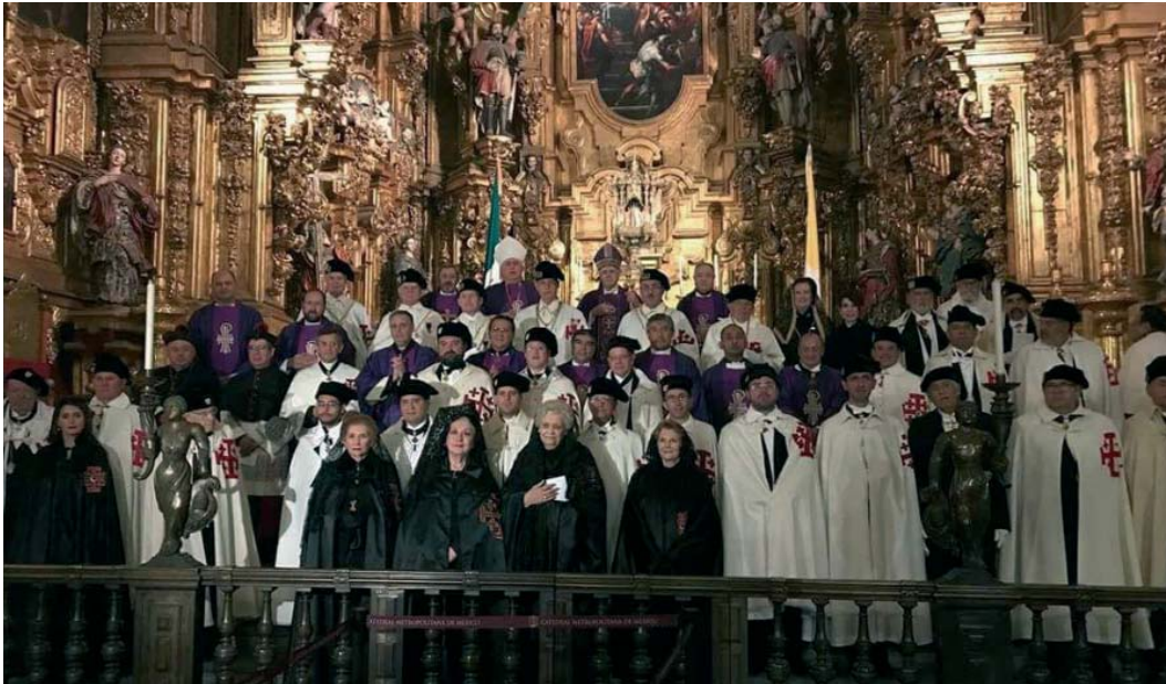
The Knights and Dames of Mexico around the Grand Master on the occasion of the Investiture in their country last December.