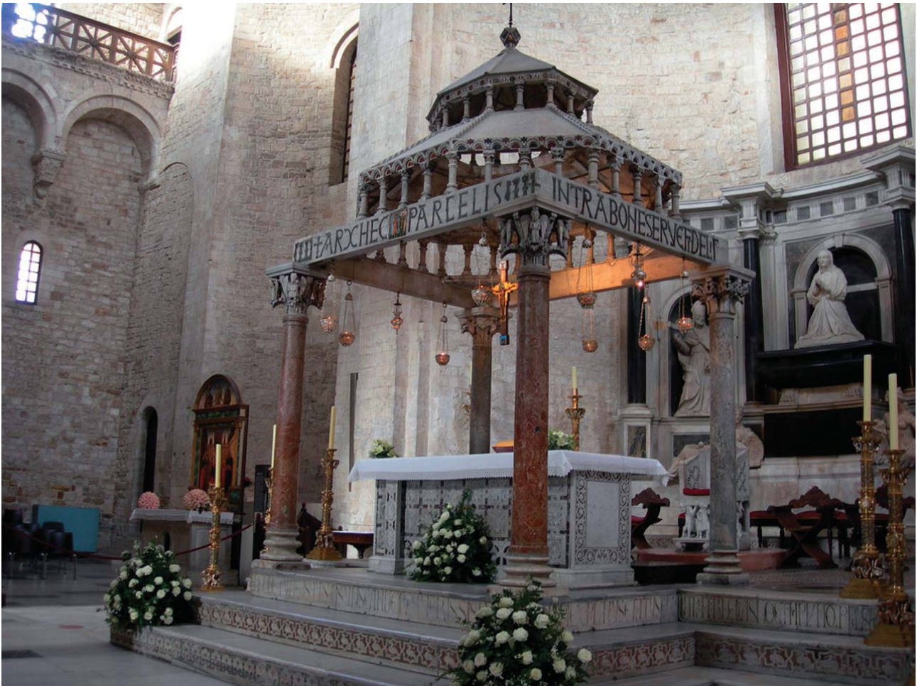
This summer the Basilica of Bari – an ecumenical and spiritual place where the relics of St. Nicholas are venerated – will host a prayer meeting for peace in the Middle East.

the East, inviting the Patriarchs of the Catholic and Orthodox Churches of all rites to Bari.