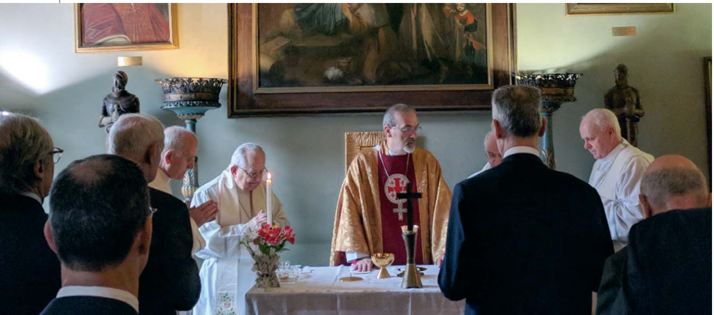
Morning Mass presided by Msgr. Pierbattista Pizzaballa in the Palazzo della Rovere, seat of the Order of the Holy Sepulchre in Rome, on the occasion of the Grand Magisterium's Spring meeting.

Following the agenda, Archbishop Pierbattista Pizzaballa – Administrator of the Latin Patriarchate – updated the members of the Grand Magisterium about the situation in his diocese, especially on a pastoral level. He rejoiced that the influx of pilgrims has been once again reconfirmed this year, especially from Latin America and Asia, despite a rather tense political context on the ground. As regards the activity of the Patriarchate, the Archbishop emphasized the desire for better coordination of the schools, thanks to the creation of a "central office", insisting on the importance of catechesis. "We are not an NGO. What is important to us is first of all