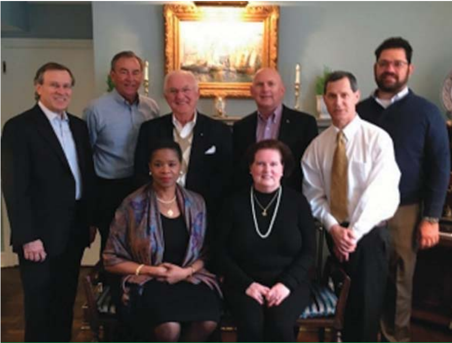
The new Lieutenants of North America together with the American members of the Grand Magisterium, gathered for an important formation day.