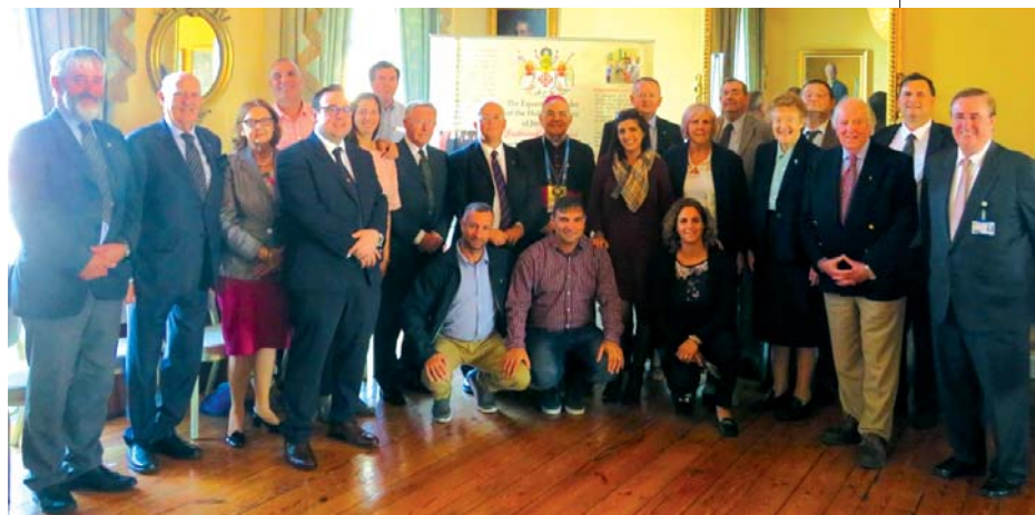
The Patriarchal Vicar for Jerusalem and some members of the Irish Lieutenancy of the Order with some couples who came especially from the Holy Land to attend the IX World Meeting of Families in Dublin.

The members of the Lieutenancy of the Order of the Holy Sepulchre for Ireland actively participated in the IX World Meeting of Families, organized at the end of August 2018 in Dublin, in the presence of Pope Francis who asked forgiveness for the scandal of abuses committed on minors by members of the clergy in this country, encouraging the bishops to continue their efforts to remedy past mistakes. A sort of WYD of the families, these world meetings created by Pope John Paul II in 1994 allow faithful to