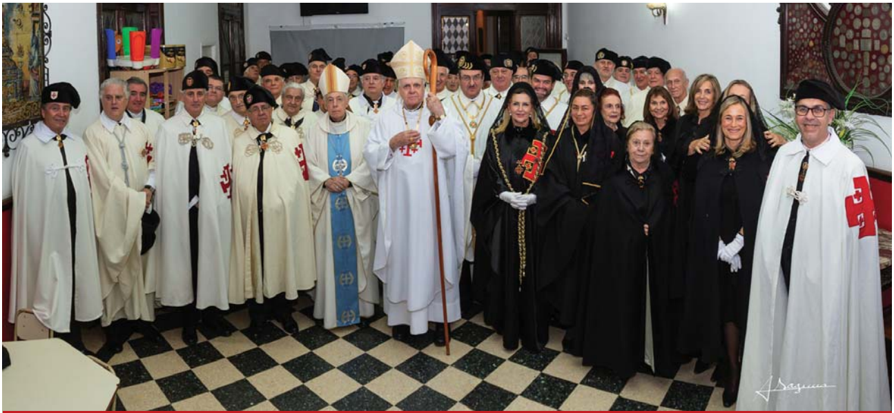
The Grand Master of the Order and the Governor General celebrated 130 years of the Lieutenancy for Argentina during an historic meeting in Buenos Aires that ended with the Investiture of new members.

two current Lieutenancies of the Order in Brazil.