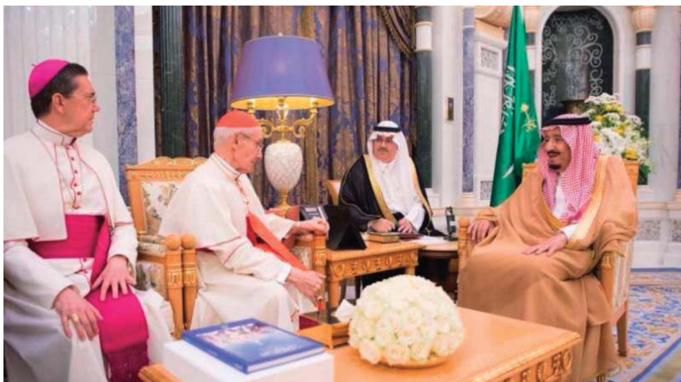
Meeting of Cardinal Jean-Louis Tauran with King Salman of Saudi Arabia, last April in Ryad (Photo: Royal Embassy of Saudi Arabia in Italy).