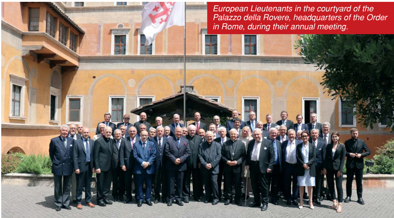
European Lieutenants in the courtyard of the Palazzo della Rovere, headquarters of the Order in Rome, during their annual meeting.

D uring their annual meeting, all the European Lieutenants wanted to express their closeness to the Governor General Leonardo Visconti di Modrone, in a hospital for a fracture. The greeting card they signed was delivered to him along with a letter from the Grand Master and a bouquet of flowers. The Governor General, who continued to work from the hospital bed, should be back at the office at the end of June.