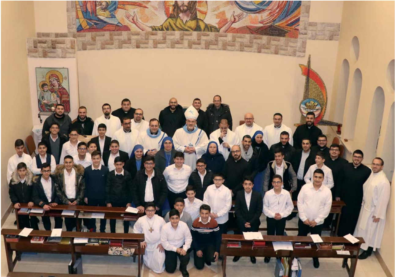
Msgr. Pierbattista Pizzaballa with the seminarians of his diocese and their formators in the seminary of Beit Jala, in Palestine.