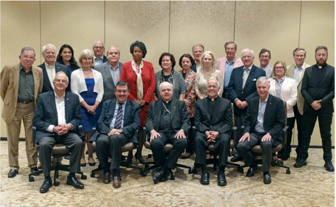
Participants in the meeting of North American Lieutenants in Houston.

subsequent discussions paid particular attention to financial management, administration and communications.