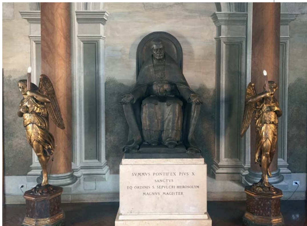
The statue of Saint Pius X presides over the great continental and international meetings organized by the Grand Magisterium, at Palazzo della Rovere, a few meters from St. Peter's Square.

August 20, 1914, a few days after the start of the First World War. He is currently the only canonized saint who belonged to the Order of the Holy Sepulchre, of which he was Grand Master. To consolidate the position of the Order in the Holy Land, Pius X reserved for himself and his successors the office of Grand Master by the Apostolic Letter Quam multa dated October 13, 1908, and gave the Knights a place in the papal chapels, whilst the Latin Patriarch was appointed Rector and Perpetual Administrator of the Order.