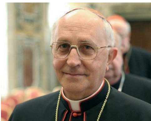
Cardinal Fernando Filoni succeeds Cardinal Edwin O'Brien as leader of the Order of the Holy Sepulchre.

Finally, I welcome His Eminence, Cardinal Filoni as Our Grand Master. His long and broad pastoral and administrative experience in service to the Universal Church will be precious assets as he leads our Order into the future. I offer him my full and fraternal support as I beg the continued intercession of Our Lady of Palestine."