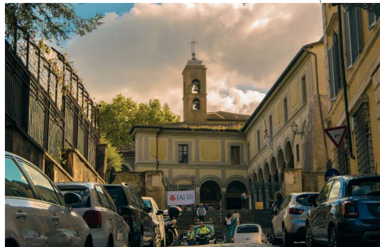
Situated on the Gianiculum hill, the convent of Sant'Onofrio (named after the famous hermit and anchorite Onophrius) was statutorily the spiritual seat of the Order of the Holy Sepulchre. It houses the tomb of Cardinal Nicola Canali, Grand Master appointed by Pope Pius XII.

On October 12 and 13, as part of the FAI Autumn Days, almost 2000 visitors were able to enter and discover the beauties of the Church of Sant'Onofrio al Gianicolo and the Tasso museum, located in the adjacent rooms that form a whole with the church and the cloister and which are entrusted to the Order of the Holy Sepulchre. For the Order, it was an opportunity to continue our collaboration with the Italian Heritage Fund (FAI, Fondo Ambiente Italiano) following on from the Spring Days 2019 in which the headquarters of the Grand Magisterium of