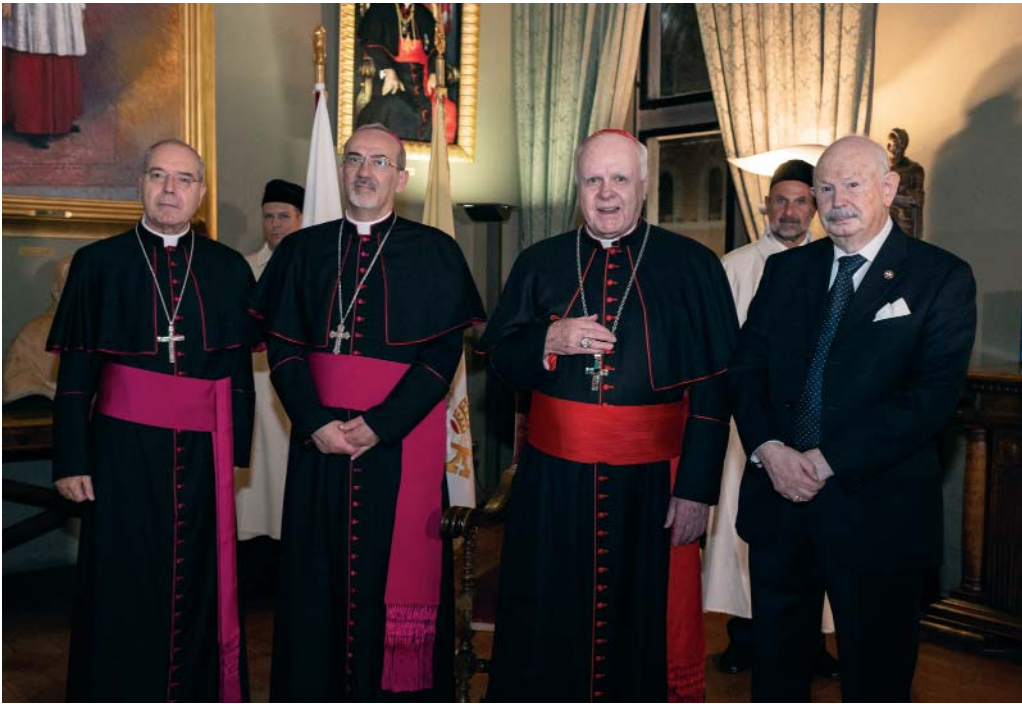
The Grand Master of the Order of Malta (pictured right) was next to the Grand Master of the Order of the Holy Sepulchre during the reception organized at the Palazzo della Rovere, on the feast of Our Lady of Palestine.