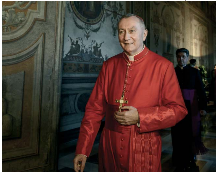
The Pope's number one collaborator, Holy See Secretary of State, Cardinal Pietro Parolin, testifies to the importance of the mission of the Order of the Holy Sepulchre for the Universal Church.

The Knights of the Holy Sepulchre were among those engaged in this noble enterprise. The earliest documents concerning them date back to 1336. From the 14 th century onwards, the Popes sought to give them a juridical regulation and they gradually expanded their tasks to devote themselves to preserving the faith in the Holy Land, supporting charitable works and social services of the Church, in particular