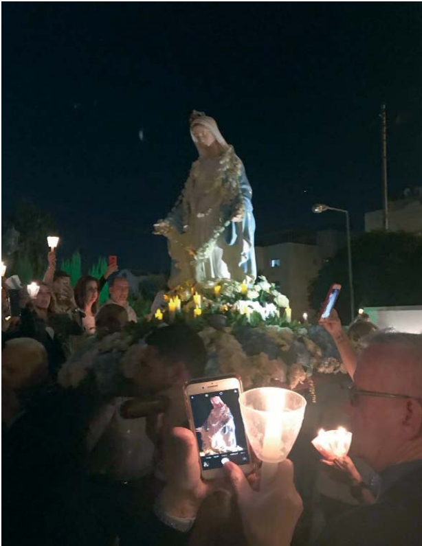
The members of the Holy Land Commission joined the heartfelt prayer of the Rosary at the parish of Mary of Nazareth in Sweifieh (Amman).

offering support to some of them. The issue of refugees – which shows no sign of diminishing in importance – has been the subject of particular attention by the Commission. With regards to Syrian refugees, "about 25% of school-age children have no access to education and this cannot be considered 'normal'," commented the Commission in its report of the visit.