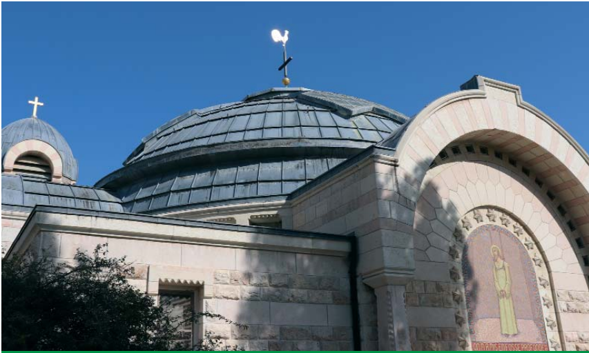
The basilica of Saint Peter in Gallicantu, erected in the place where Jesus was interrogated by the High Priest Caiaphas and the leaders of the synagogue, is one of the most significant places of pilgrimage in Jerusalem.

religious community that runs the sanctuary. "This holy place is edifying. The more time I spent here, the more I realize the depth of the mystery of our salvation. Here we remember not only Peter's denial and Christ's forgiveness but also the denial of the Son of God by the Sanhedrin and his descent into the pit. The prison under the crypt of the church is a moving place where pilgrims pray Psalm 88: 'You have put me in the lowest pit; [...] I am confined and cannot escape.' (Ps 88:7.9)"