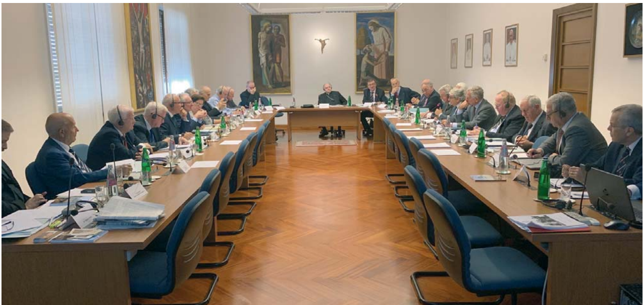
At the Grand Magisterium's autumn meeting the Apostolic Administrator of the Latin Patriarchate of Jerusalem, Msgr. Pierbattista Pizzaballa, outlined the situation in his vast diocese to the Order's main authorities in charge of coordinating aid sent to the Mother Church in the Holy Land.