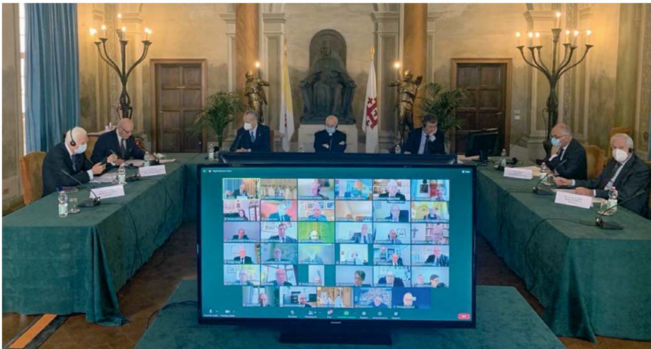
The spokespersons of the Lieutenants' groups raised a number of issues, alerting to the difficulties of the members in these times of health and economic crisis, especially in Eastern European or Latin American countries where social problems make fundraising very difficult.

The spokespersons of the linguistic and geographic groups of the European Lieutenants, as well as the Latin American Lieutenants, spoke in turn, asking a variety of practical questions (recruitment of young