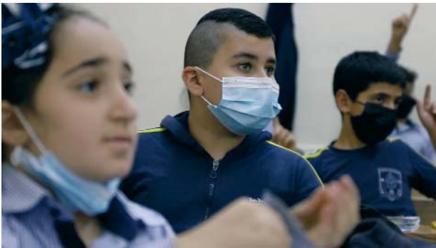
Pastoral activities, particularly at the service of the youth.

Jerusalem works alongside parishes and local communities in the region, and organizes pastoral and liturgical activities in the Holy Land through its Liturgical Office, its Catechetical Office and its Pastoral Office. Thanks to the support of the Order of the Holy Sepulchre, these three offices have been able to widen their field of action and organize numerous events and activities.