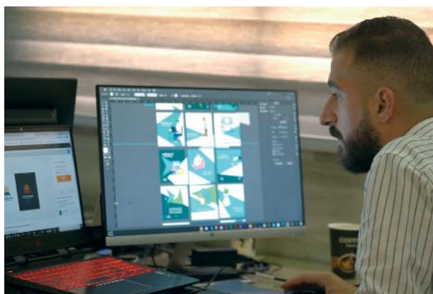
Job creation programs in the most disadvantaged areas of the Holy Land.