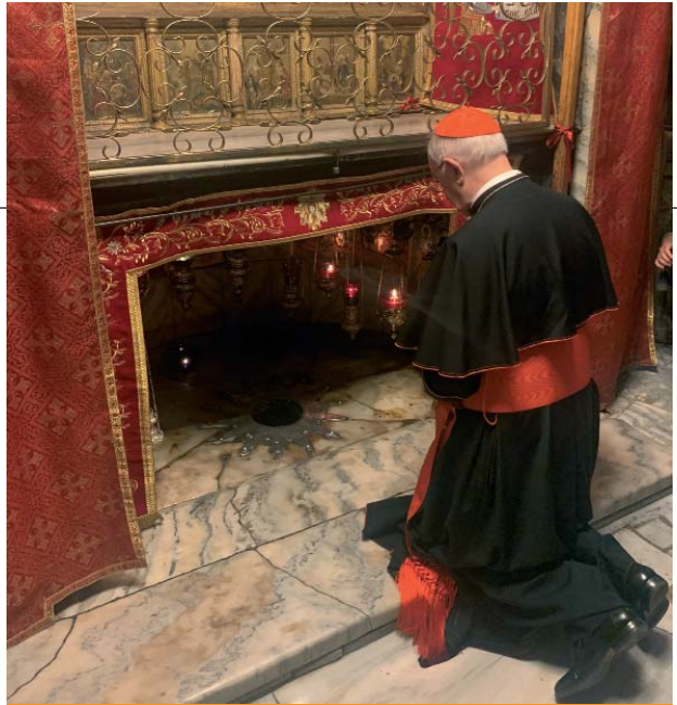
Moment of meditation in the Grotto of the Nativity, followed by a visit to children with disabilities of the Hogar Niño Dios center, in Bethlehem.