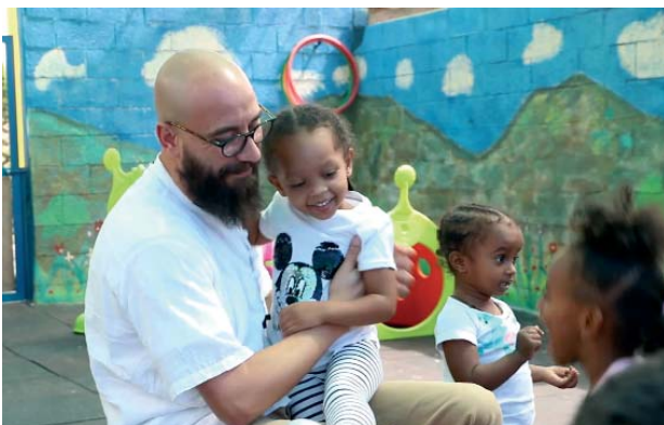
Welcoming the children of foreign workers and migrants.