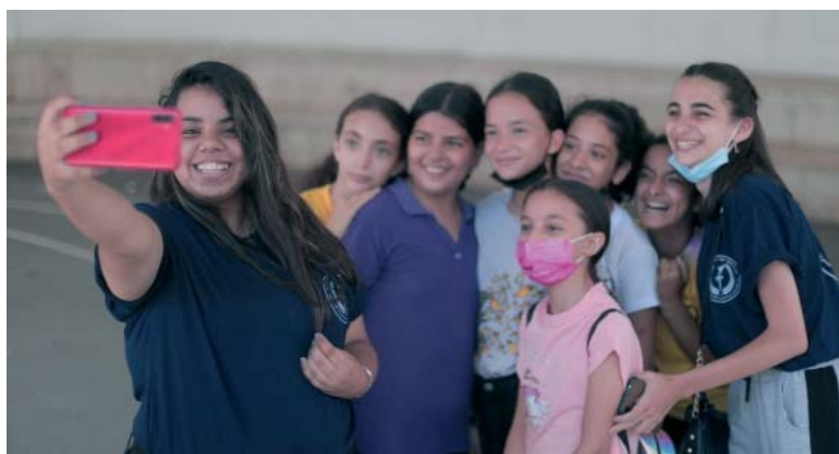
Supporting hope in Gaza.