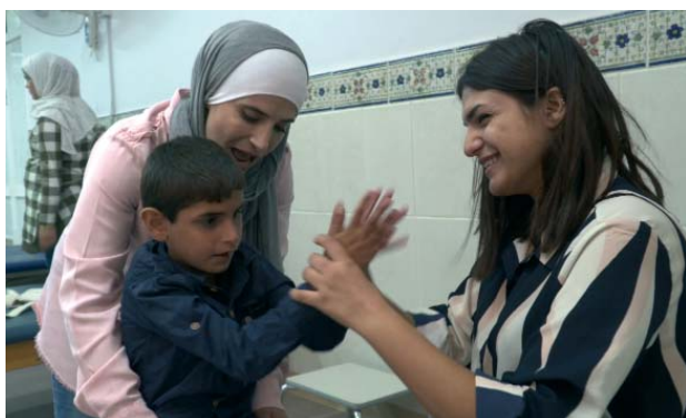
Help to the poor.

In Jordan, the Our Lady of Peace Center strives "to help the poorest of the poor, especially people with disabilities." Father