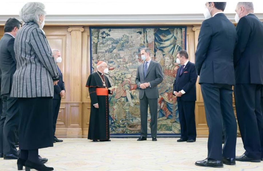
The King of Spain receiving the Grand Master and high representatives of the Order last April, in Madrid.

wanted to speak to everyone, and he listened to the two Lieutenants describe their commitment to charitable works in the Holy Land, while commenting on their remarks.