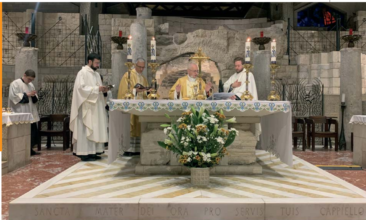
The Mass in the Basilica of the Annunciation in Nazareth was an opportunity to entrust all the members of the Order and their friends in prayer to the Virgin Mary.

During the afternoon, he and his delegation attended a presentation by the directors of the 25 Jordanian schools of the Latin Patriarchate. The latter described their