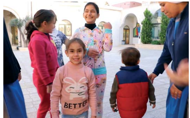
Support for people in need, such as orphans.

In collaboration with the Latin Patriarchate of Jerusalem and a network of Catholic institutions, the Order also invests in the care and support of the elderly and orphans, as well as people with disabilities. Among the establishments that offer these services, without discrimination, living the Gospel in depth, is the retirement home of Beit Afram in Taybeh, which offers quality care to the elderly, encourages spirituality among its guests and its employees and enables them to interact with different church groups. In Jerusalem, at Saint-Louis, also called the French Hospital, terminally-ill patients are offered palliative care. "Here we have patients of all religions: Christians,