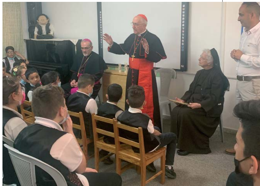
Cardinal Filoni in discussion with the students of a school in Palestine.

During the meeting, the Grand Master insisted on the importance of the education