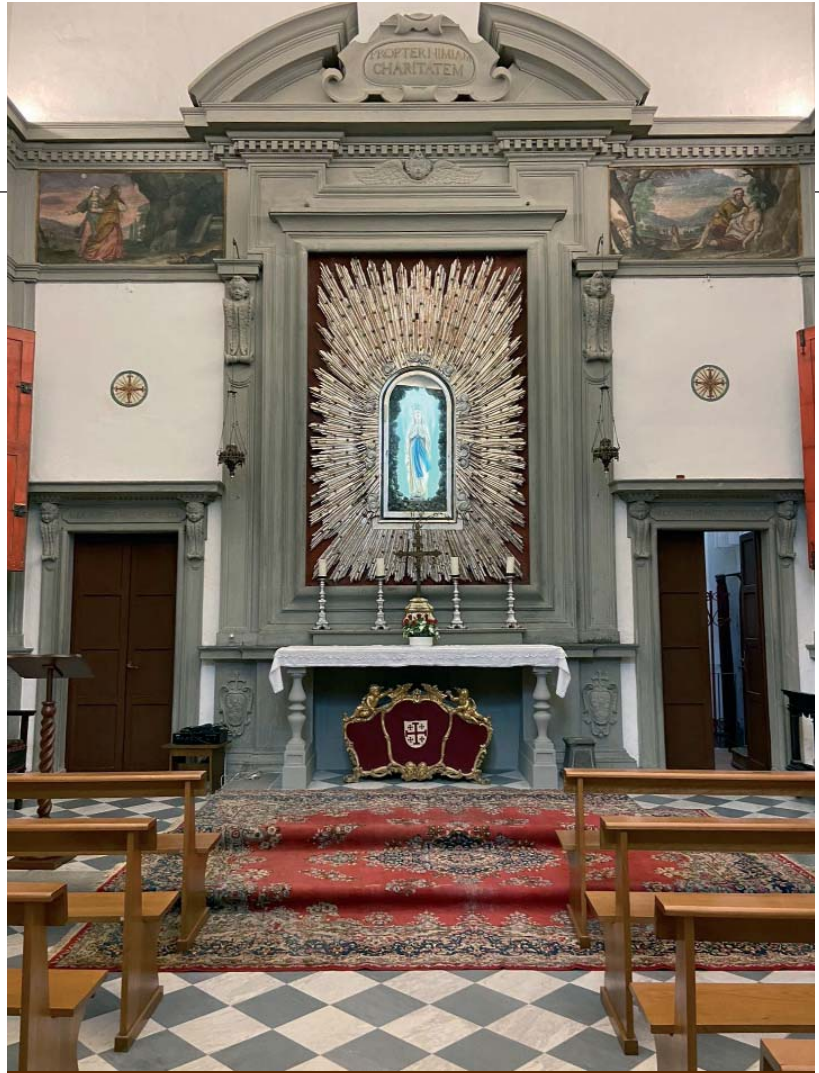
In 1986, the Archbishop of Florence assigned the Church of Saints James and Philip to the Order.

In 1821, the church and the rooms in Via