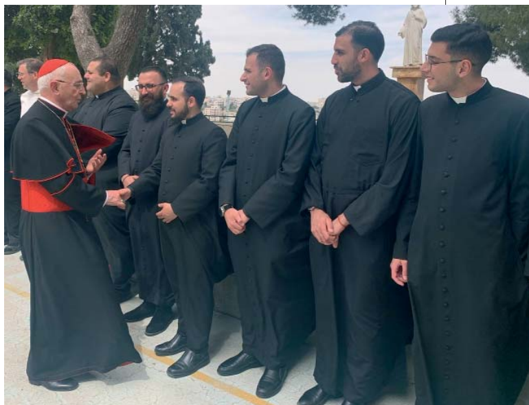
The Grand Master is welcomed at the seminary of Beit Jala.