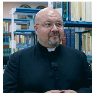
Forming priests in the seminary.