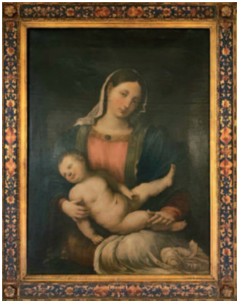
A painting of the Virgin Mary holding the Son of God adorns the throne room of Palazzo della Rovere, the Order's headquarters in Rome.

Apocalypse (Rev 21:2) which, as a caring Mother, she protects and guards. An ancient image of Mary with the Child on her knees is also kept at the Order's headquarters. An analogy immediately comes to mind: one could almost say that the Church, which recognizes Mary