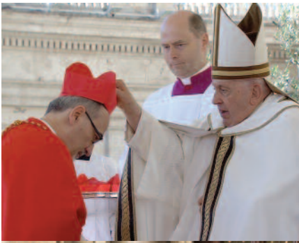
The Order's authorities, as well as Knights and Dames, surrounded the Patriarch of Jerusalem, Grand Prior of the Order, with prayer and respectful affection. He was elevated to the dignity of cardinal by Pope Francis on September 30.