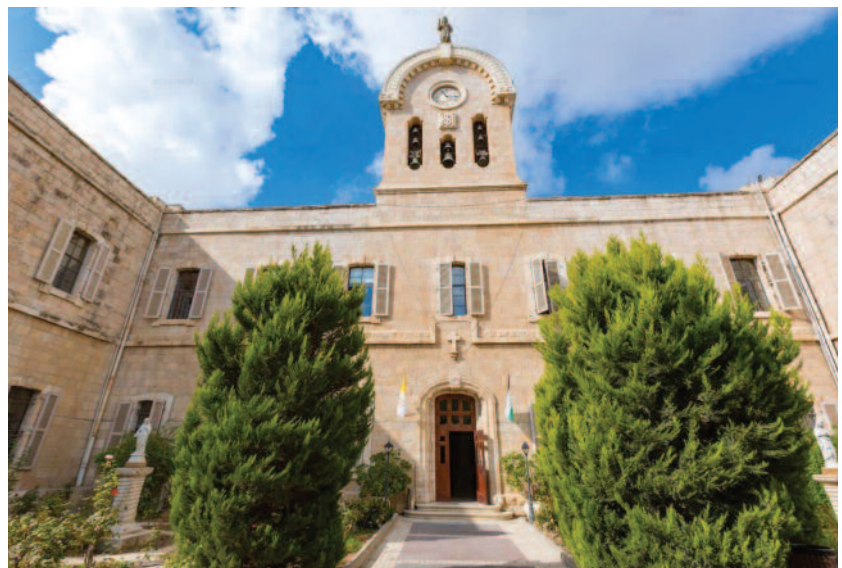
Bethlehem University, which helps young Palestinians stay in their own country, has received support from the Order for many years.