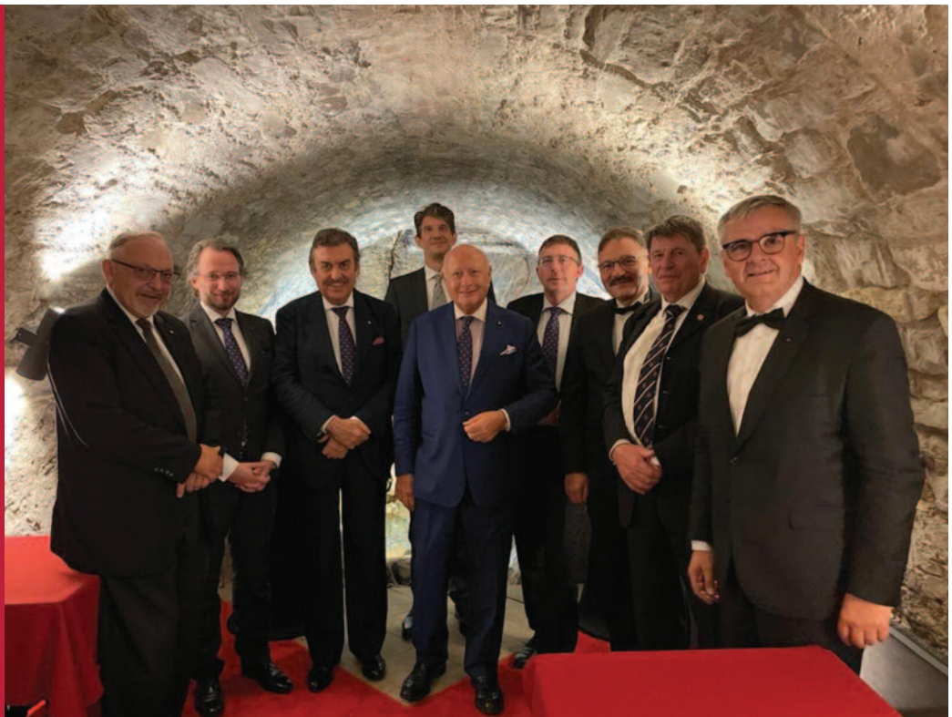
Meeting of the Central and Eastern European Lieutenants in Prague with the Governor General and the Vice- Governor for Europe.

The Governor General began by recalling the reason why he considered promoting the formula of sectorial meetings in Europe, after noting that the formal general meeting