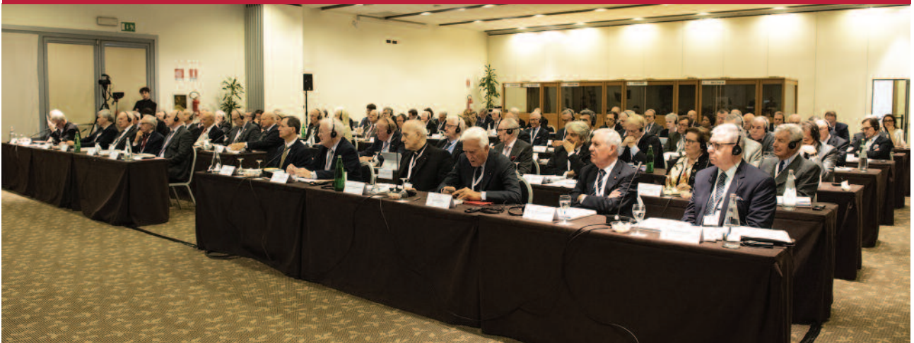
Participants of the Order's Consulta in 2018, during a working session.

The Consulta is the Grand Master's main consultative body in a synodal spirit and, as