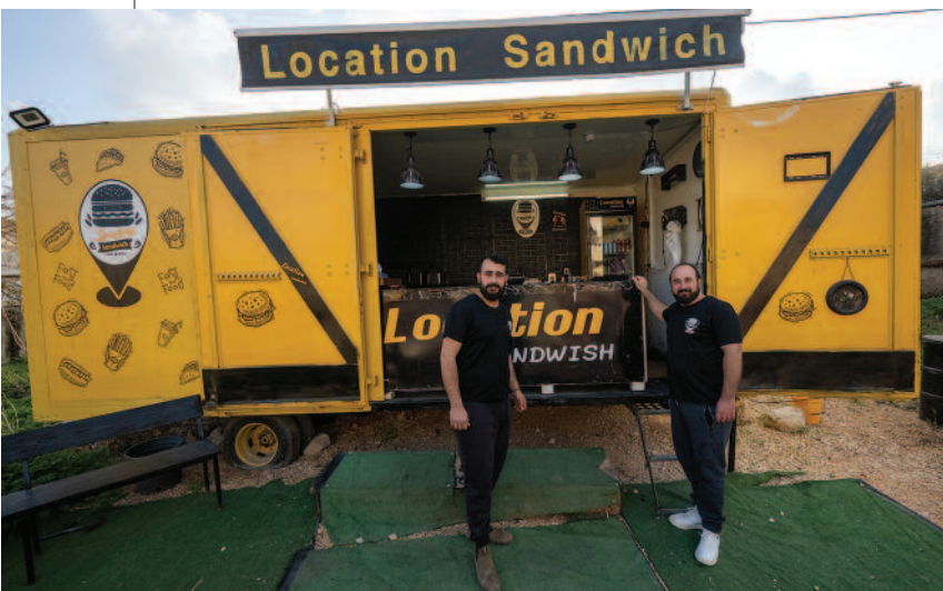
Among the businesses that have been sustained as a result of the AFAQ project is the food truck opened by two young people in Jenin, enabling them to earn a decent living from their work.