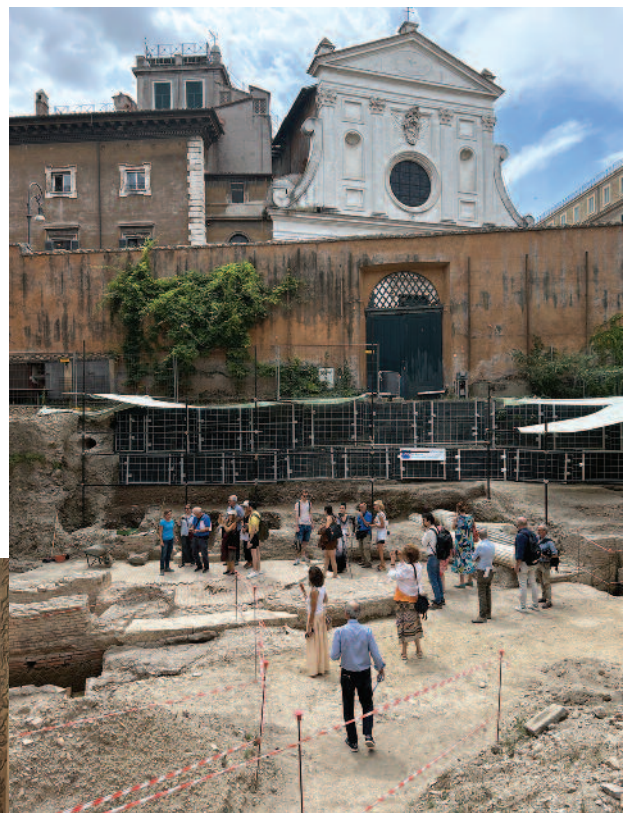
Press conference at Palazzo della Rovere, July 26, 2023, to present recent archaeological discoveries.

available online, reported on these discoveries, also taking the opportunity to present the Order of the Holy Sepulchre's mission to serve the culture of encounter in the Holy Land.