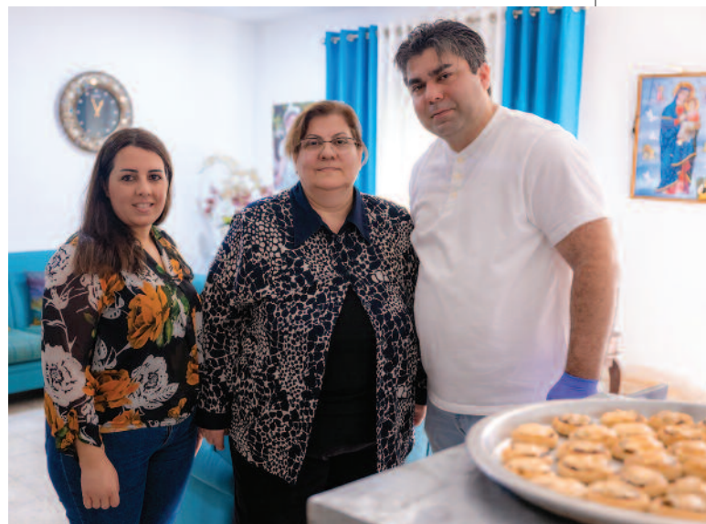
Thanks to the AFAQ project, a family in the Holy Land was helped to improve their small baking business right in their own home.

career guidance to better serve their students and help them learn about their aptitudes and possible career and academic paths; 19 start-ups were supported through a grant of $3,000 each; 29 existing small businesses received a $2,000 grant to improve their operations and increase income; 47 unemployed graduates were given the opportunity to carry out an internship for a period of 3 to 6 months to support them in their entry into the labor market (at the end of the project, more than 40% secured permanent employment contracts, thus emerging from unemployment); 63 young people and women received a vocational scholarship to gain practical experience in a specific