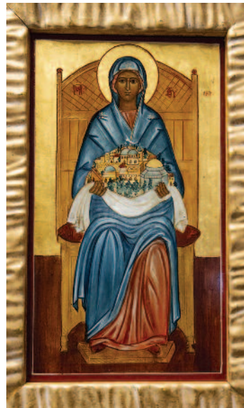
An icon of Our Lady of Palestine, painted by the Sisters of Bethlehem, depicts the Mother of God carrying in her heart the city of Jerusalem and its inhabitants of all confessions, a symbol of the new humanity.

relationship in order to pass it on, through John (" Behold your mother "), to the new family that he was establishing in his death and resurrection; since then Mary belonged to the Church for which her Son had given his life as a ransom. This thought belongs to the deepest spirituality of the Order, which cherishes the same places that belonged not only to the life of Jesus, but