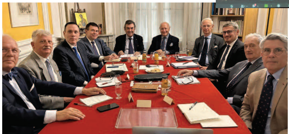
Governor General Leonardo Visconti di Modrone, surrounded by the Vice-Governor for Europe, Jean-Pierre de Glutz, and French-speaking Lieutenants, during a coordination meeting in Paris.