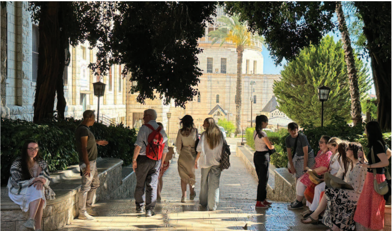
Students from Glasgow and Bethlehem Universities forged friendships that give hope for future collaboration.

people whose generous contributions made lasting impressions. A good deal of time was spent at the Latin Patriarchate hearing about and discussing the role of the Catholic Church in the Holy Land - especially in relation to humanitarian aid."