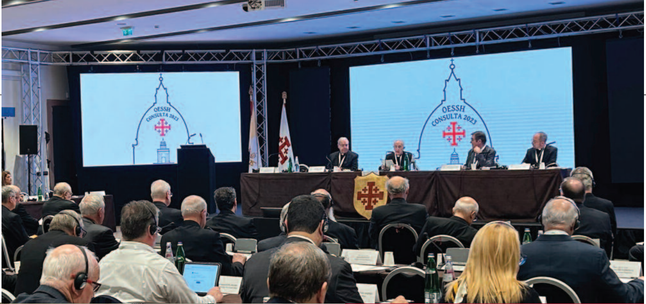
The Grand Master, the Assessor and the Governor General guided the work of the Consulta during several plenary sessions enriched by the interventions of representatives of the Holy See.