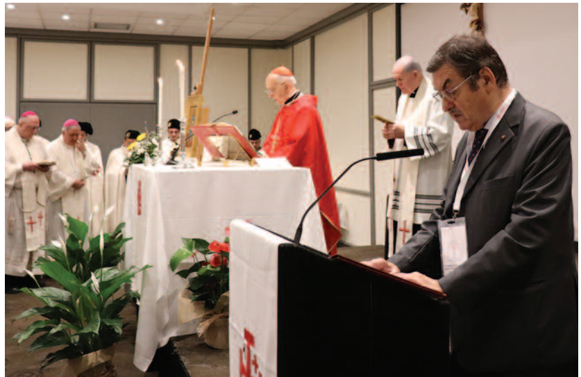
The Governor General, Ambassador Leonardo Visconti di Modrone, reading the prayer of the Knight and Dame at the end of a mass celebrated during the Consulta, in the hotel where the international assembly of the Order took place.

On the next day, the Feast of the Exaltation of the Holy Cross was celebrated. Cardinal Filoni invited participants to live the Cross as an instrument of salvation that