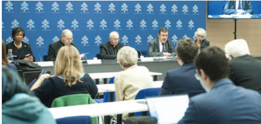
Many journalists were present at the press conference presenting the Consulta which was held on October 31 in the Holy See Press Office.