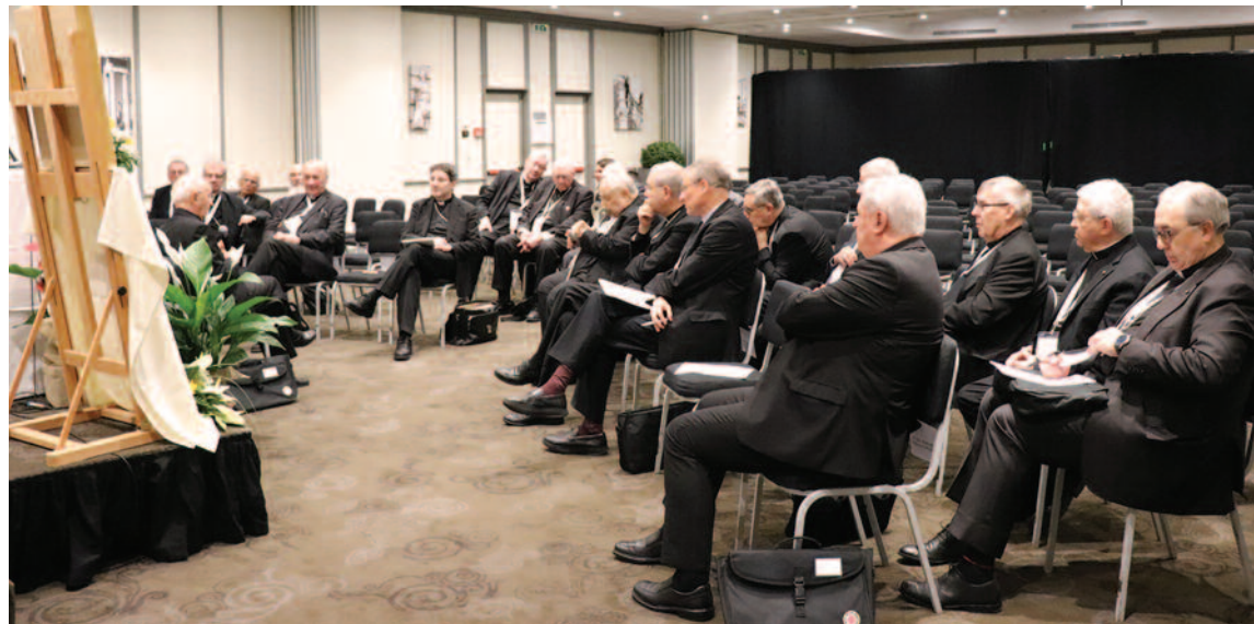
The Grand Priors present at the Consulta spoke with the Grand Master about the spiritual life of the members of the Order.