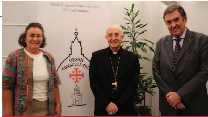
An official photo immortalized the bilateral meetings, as here with the Lieutenant for Colombia.