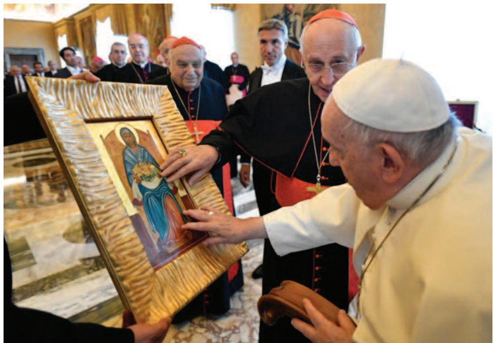
The icon of Our Lady of Palestine, Patroness of the Order, was blessed by the Holy Father on November 9, during the audience he granted to the participants of the Consulta.

The Knight and Dame, who take the time to