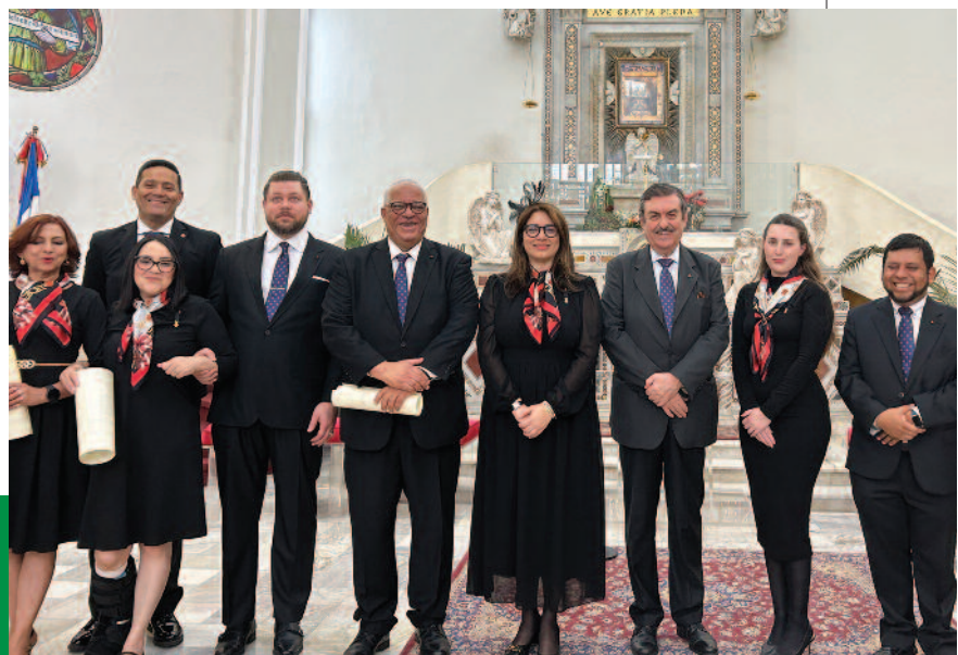
Governor General Visconti di Modrone surrounded by the Magistral Delegate and the new Members of the Order in Santo Domingo.

Over the next two days, the striking Primatial Cathedral of America, a sign of the evangelization of the entire continent from