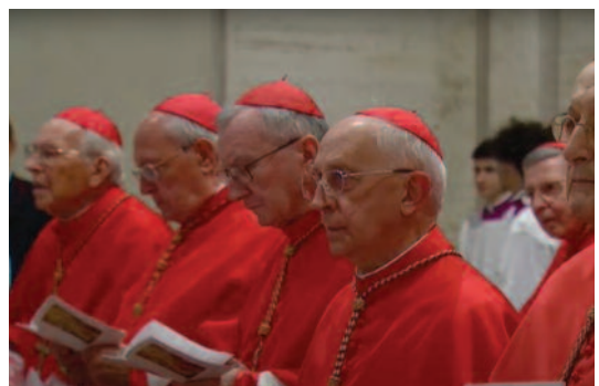
In St Peter's Basilica on May 9, Pope Francis read the Bull of Indiction for the 2025 Jubilee, in the presence of the Cardinals, including the Grand Master of the Order, announcing the opening of the Holy Door for December 24, 2024.