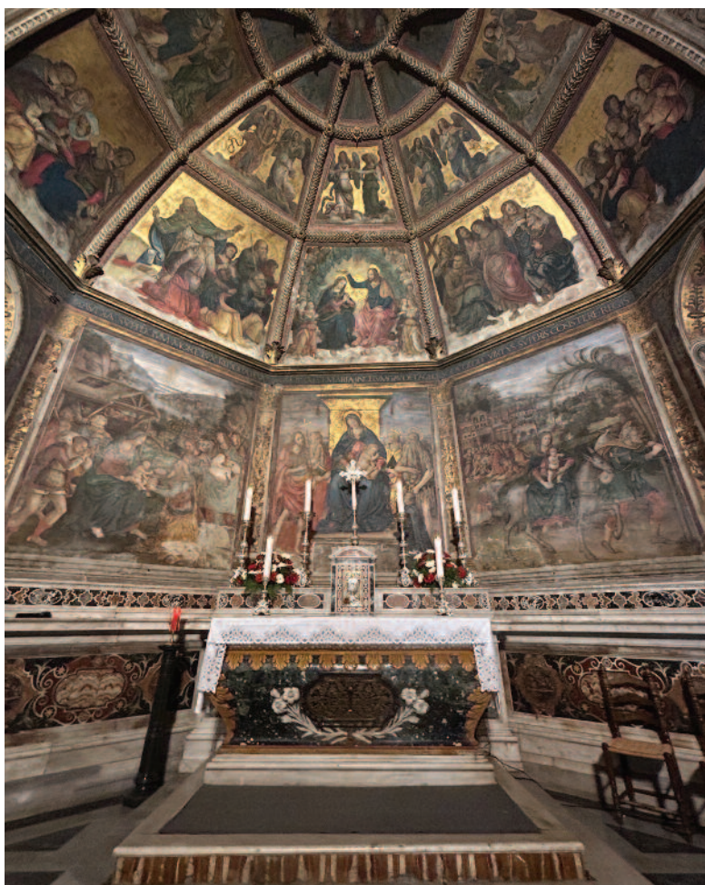
The apse of the church of Sant'Onofrio al Gianicolo in Rome, is a pure marvel that evokes the heavenly peace into which the liturgy of the Mass plunges us, even in this life.

legitimate cessation of the Order of Hermits of St. Jerome [the monks who initially inhabited the site] – can fittingly accommodate this Equestrian Order and can provide it with a convenient centre for the carrying out of its religious ceremonies and its acts of piety and works of charity.”