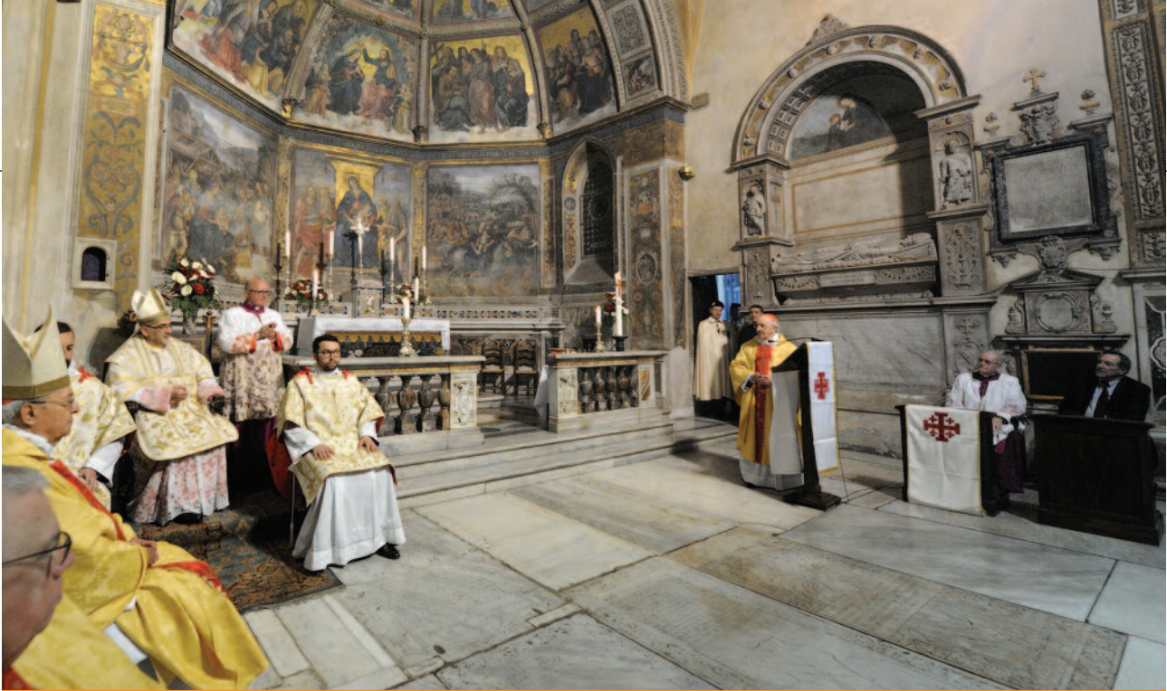
In his titular church, Sant'Onofrio al Gianicolo, as he took possession of it in Rome on May 1, the Patriarch of Jerusalem was greeted by the Grand Master, present with the authorities of the Grand Magisterium and of the Lieutenancy for Central Italy. This church has been the spiritual seat of the Order since 1948, by the will of the Venerable Pius XII.

something important and great," but, he continued, "the Kingdom of God does not grow like this. It grows in the community, with the gestures of the community, peacefully, little by little." Then he concluded: "As the Church of the Holy Land and of Rome, we are called, in union, to be this seed."