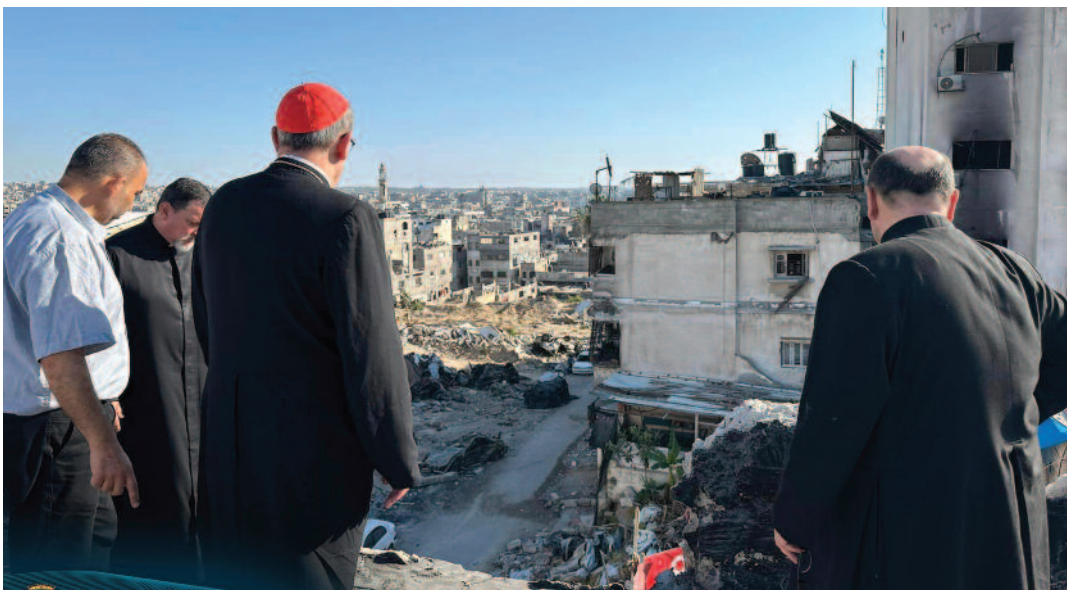
The Patriarch of Jerusalem observing the destruction, during his first visit to Gaza since the start of the war.

This is the Church of the Holy Family, where those gathered there have been living