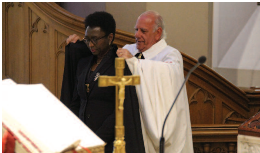
The Magistral Delegation of the Order in Southern Africa contributes to the Church's efforts in the service of universal fraternity.

and exchange between like-minded Lieutenancies, which is strongly encouraged by the Governor General.