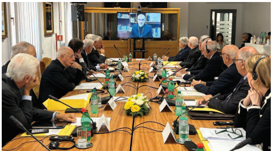
The Patriarch of Jerusalem, who was hindered from departing from the Holy Land, addressed the meeting participants through a video message, thanking the Order first and foremost for its moral and spiritual support.

The Patriarch of Jerusalem, who was hindered from departing from the Holy Land, addressed the participants via video message, thanking the Order for all its moral and spiritual support – "we need your prayer" – also referring to the beautiful letter from the Pope to the Catholics of the Middle East , published on October 7, in