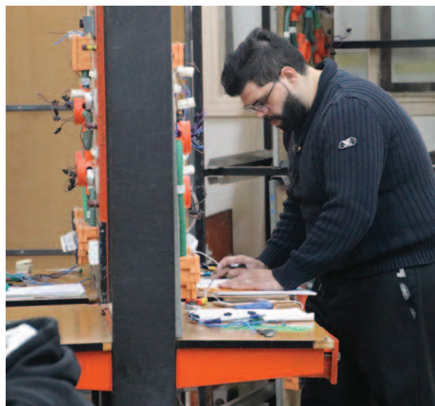
Paid internships for young people in the Holy Land are funded thanks to the support of the Order.

This support has alleviated many financial burdens for those who have been unemployed, lost their jobs, or were at risk of becoming unemployed, providing financial relief and hope for a more stable future for many Christian households in the