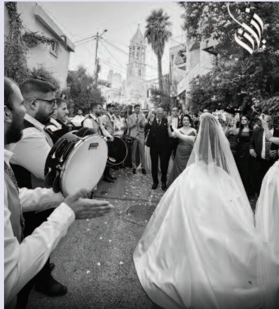
The solidarity of the Order permits young people to engage in their own activities. Here we see a music group that performs at weddings and public events.

■ K.A. from Ramallah was unemployed for a month and a half before being assigned to supervise a short-term project renovating old buildings, such as schools and offices, for the Latin Patriarchate in Ramallah. This project provided employment for seven construction workers who had lost their jobs due to Israel's halation of all Palestinian construction-worker's permits. As their