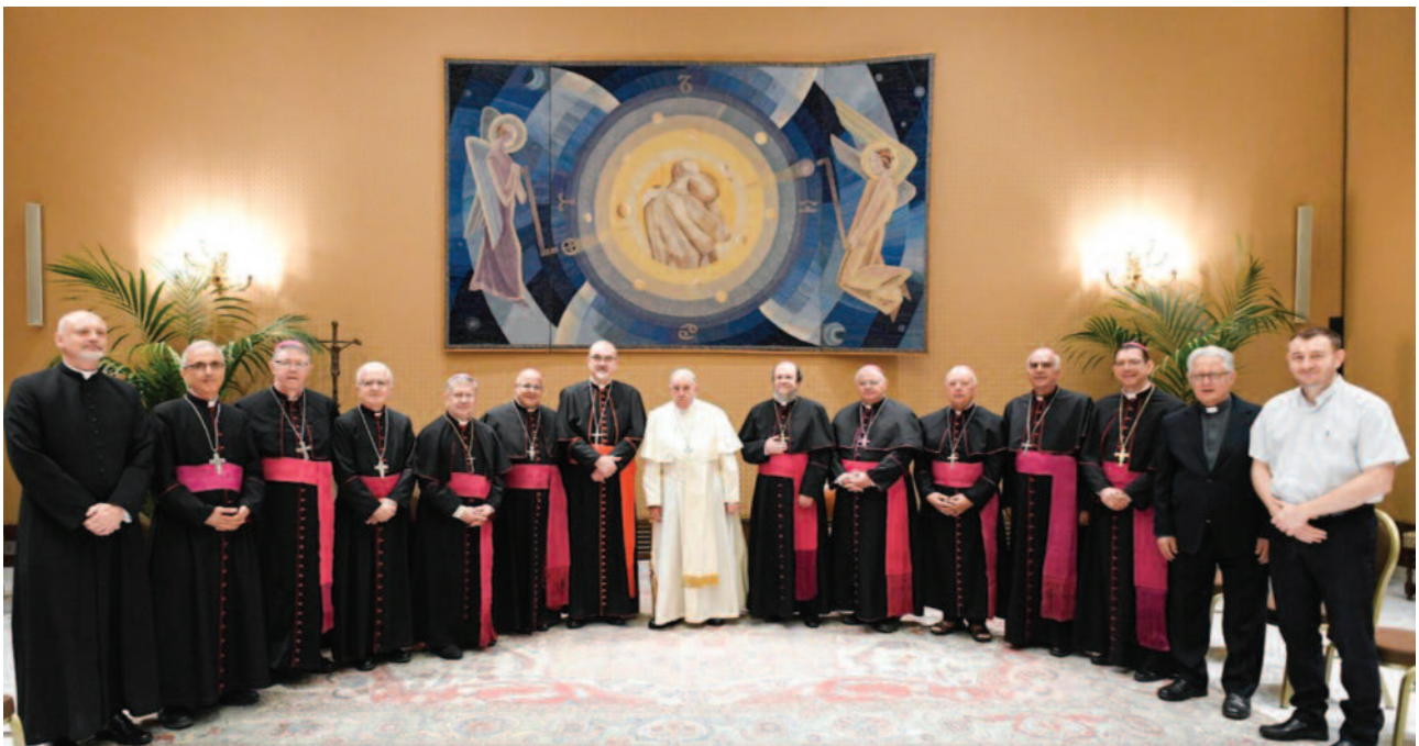
A group photo taken at the end of the meeting with the Pope and the CELRA Bishops. The meeting was presided over by Cardinal Pierbattista Pizzaballa, the Latin Patriarch of Jerusalem and Grand Prior of the Order.

of very strong tension, which in some contexts lead to open clashes and outbursts of war. The conflict, instead of finding an equitable solution, seems to become chronic, with the risk that it will spread to ignite the entire region. This situation has caused