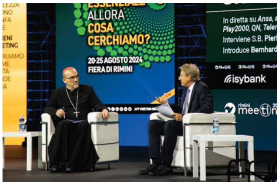
Cardinal Pizzaballa spoke about the situation in the Holy Land during the Meeting for Friendship among Peoples, which took place in Rimini this summer.

In this regard, Cardinal Pizzaballa is often asked what the Church can and should do in this situation. His honest and pragmatic response helps us all to position ourselves, "Let's be honest, no one expects the Christian community to solve the problems. Politically, we are more or less irrelevant, if I may say so. [...] The first thing is to be there, to be present. Not to fall into the temptation of wanting to forcefully play a role in these situations, but to be able to speak a word [...], a word of truth about what is