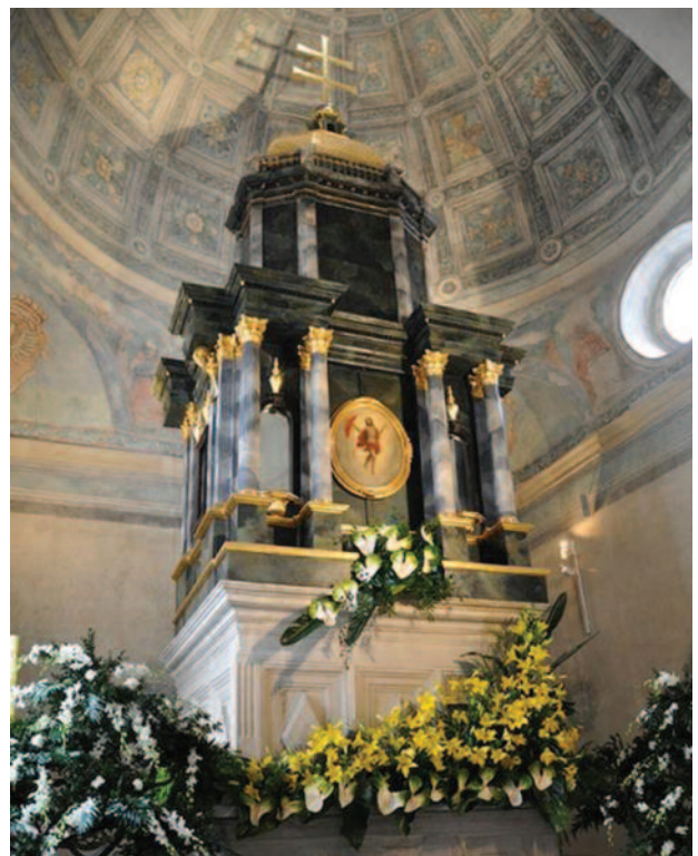
The reproduction of the Aedicule of the Holy Sepulchre in Poland, which dates back to the 16 th century, is the focal point of a major pilgrimage that takes place every two years.

The Jerusalem Days are celebrated in conjunction with the Feast of the Exaltation of the Holy Cross. This celebration is