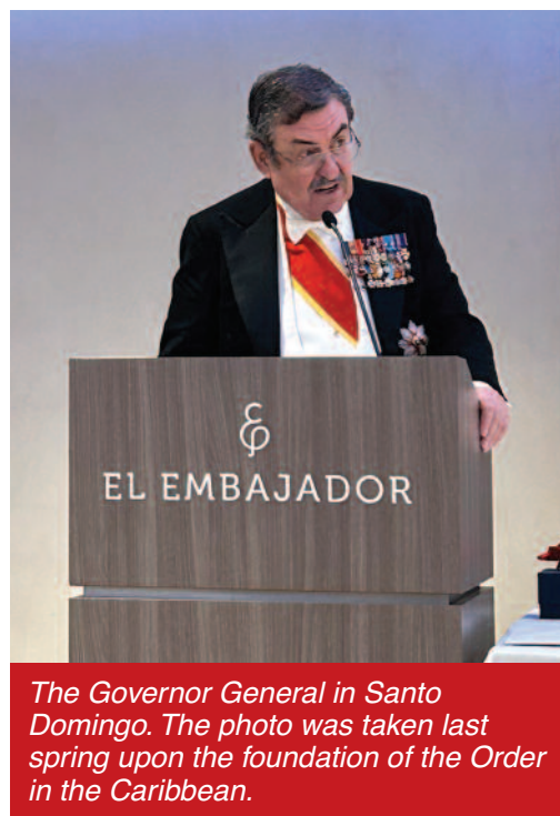
The Governor General in Santo Domingo. The photo was taken last spring upon the foundation of the Order in the Caribbean.

This process has especially benefited medium and small Lieutenancies, or those geographically more