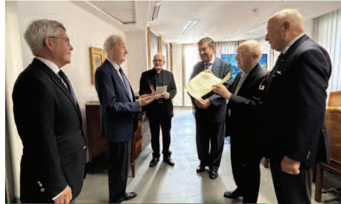
The Lieutenant of Honor for France was awarded the Golden Palm in Rome by the Grand Master, in the presence of the Governor General.