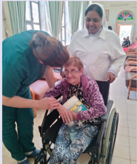
Thanks to donations from members of the Order, new jobs are being created in the Holy Land, including in the field of social assistance.