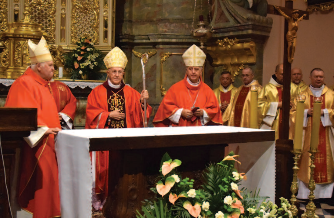
The Mass at Miechów presided over by the Grand Master of the Order.

and dies, it remains alone; but if it dies, it bears much fruit' ( John 12:24 )."